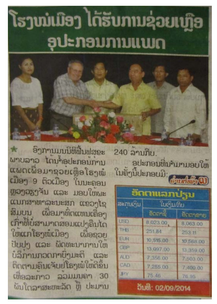
September 2, 2014