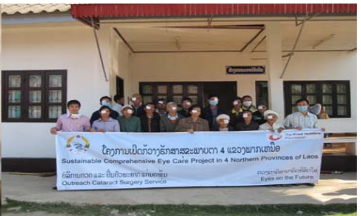
Cataract post-operated cases 1 st day at Bokeo Provincial Hospital