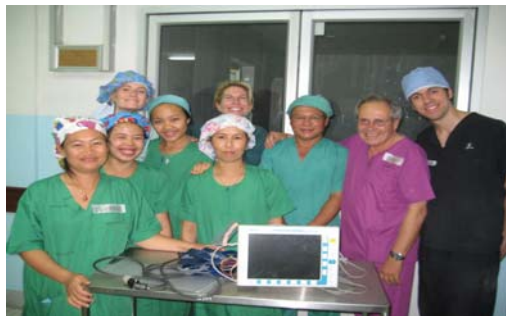
Donated equipment for operation room

Lao Rehabilitation Foundation donated the medical equipments and medicines for Bokeo Provincial Hospital, Pha-Udom and Paktha districts hospital.