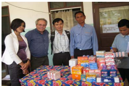
Donated medicine for Pha-Udom district hospital