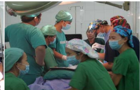
US joint Lao team to operate cleft lip in operation room