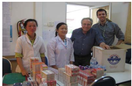
Donated medicine for Paktha district hospital