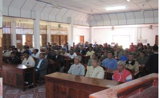
Participants, retired and handicap persons in meeting room for Refractive Service