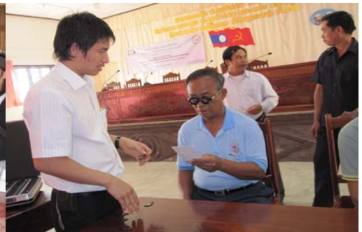
Refractive Service with donated glasses