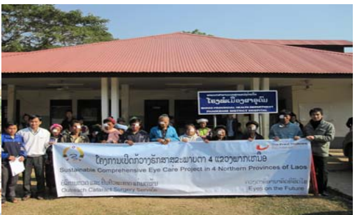
Cataract post-operated cases 1 st day at Pha-Udom District Hospital