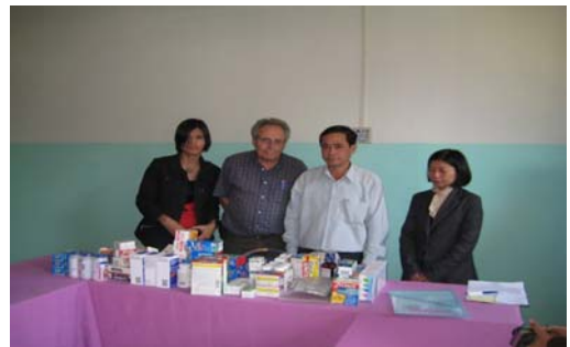
Donated medicine for Bokeo Hospital