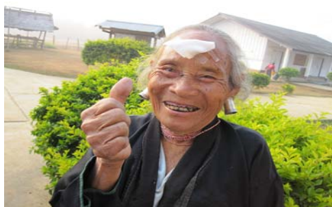
Cataract post-operated case 1 st day is happy with good vision ( Museum ethnic )