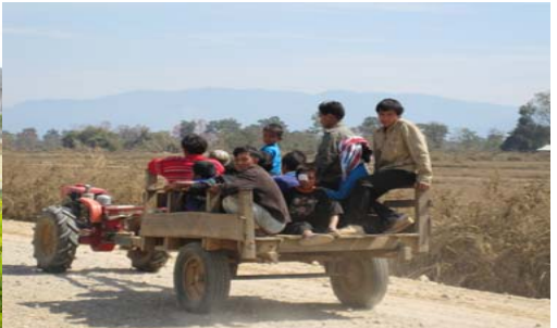
Cataract post-operated case ( Go back home by tractor )