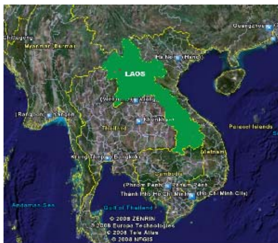
Laos and Bokeo provinces map

The public health system includes 1 provincial hospital, 1 military hospital, 5 district hospitals and 30 health care centers.