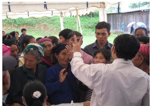
Visual acuity test performed by ophthalmic nurse