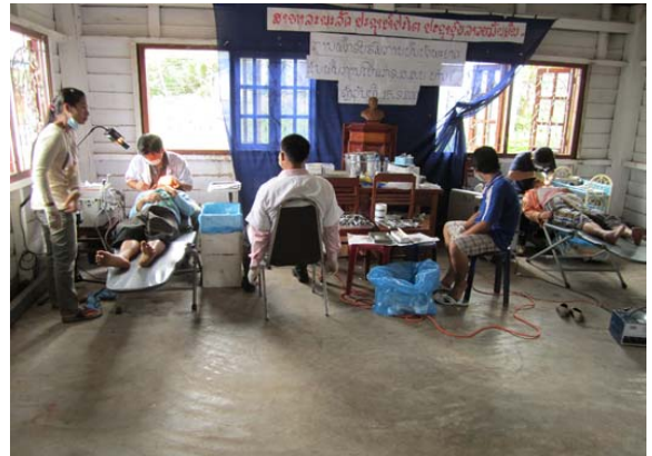
Dental patients are examined and treated