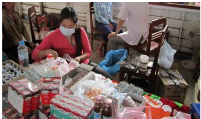
The medicine is provided patients by doctor's order