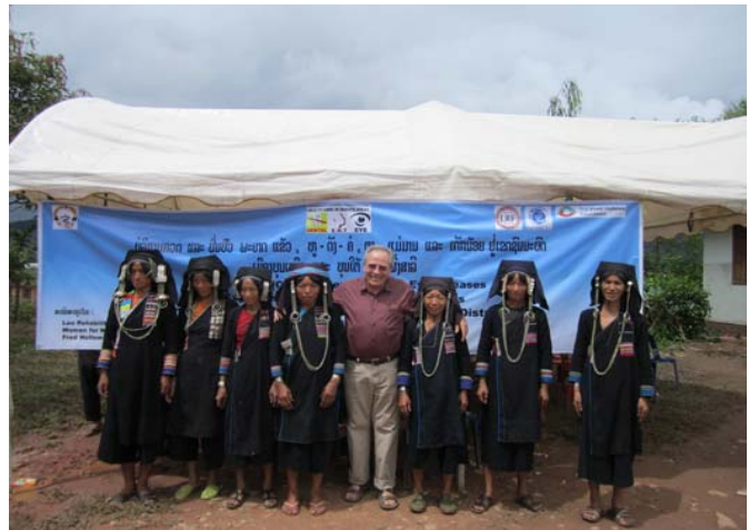
Ekor ethnic meet the team for health check

The team provided service to all patients, with no regard to gender, age, ethnicity or religion. Services were free of charge for all patients 3,056 cases.