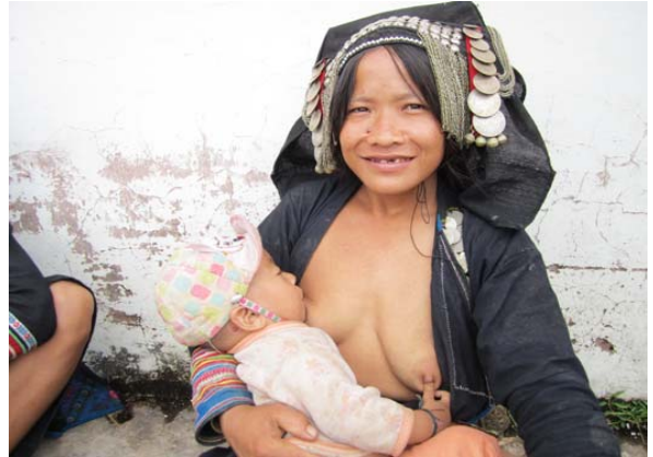
Ekor women taking care of her child while waiting to be examined