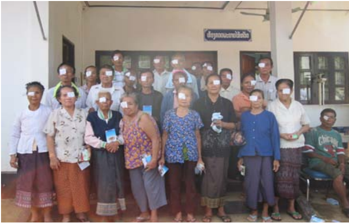
Cataract post-surgery 1 st day In Huixay district, Bokeo province