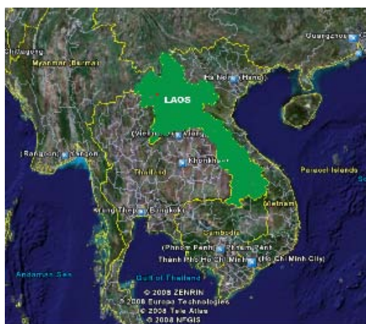
Map of Laos

The four Northern provinces of Phongsaly, Luang Namtha, Oudomxay and Bokeo are 85% high mountain regions. With a population of 735,119 (Female: 362,721), many people are poor and live in remote area. They subsist mainly on agriculture, and have only limited access to healthcare, particularly eye, E.N.T., dental, expectant mother and children care.