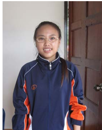
A man 17 years old and a woman 18 years old, Improvement of vision by glasses