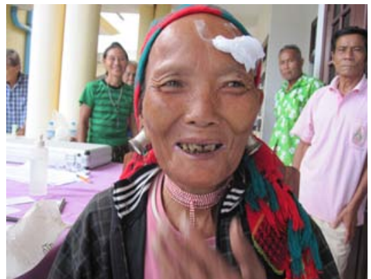
Cataract post-surgery 1 st day