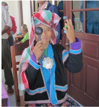
Visual acuity test