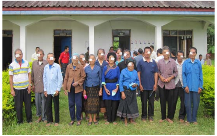
Cataract post-surgery 1 st day In Yord-U district, Phongsaly province