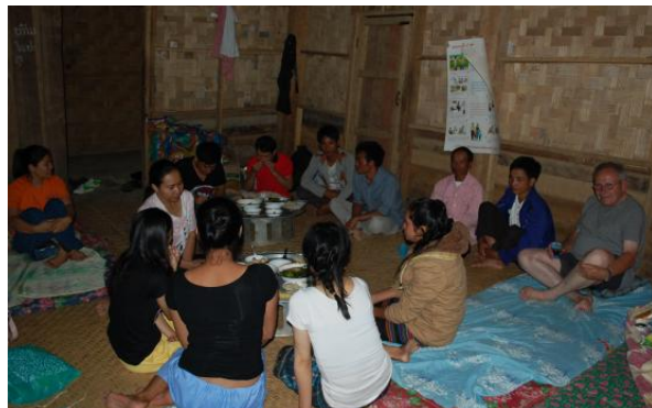
Teamwork at home stay, having dinner jointly with villagers