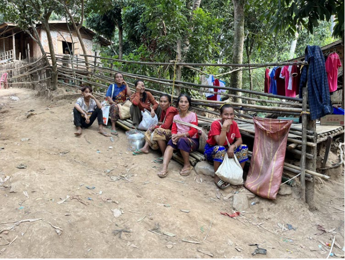
Living condition of people At LuangTong village