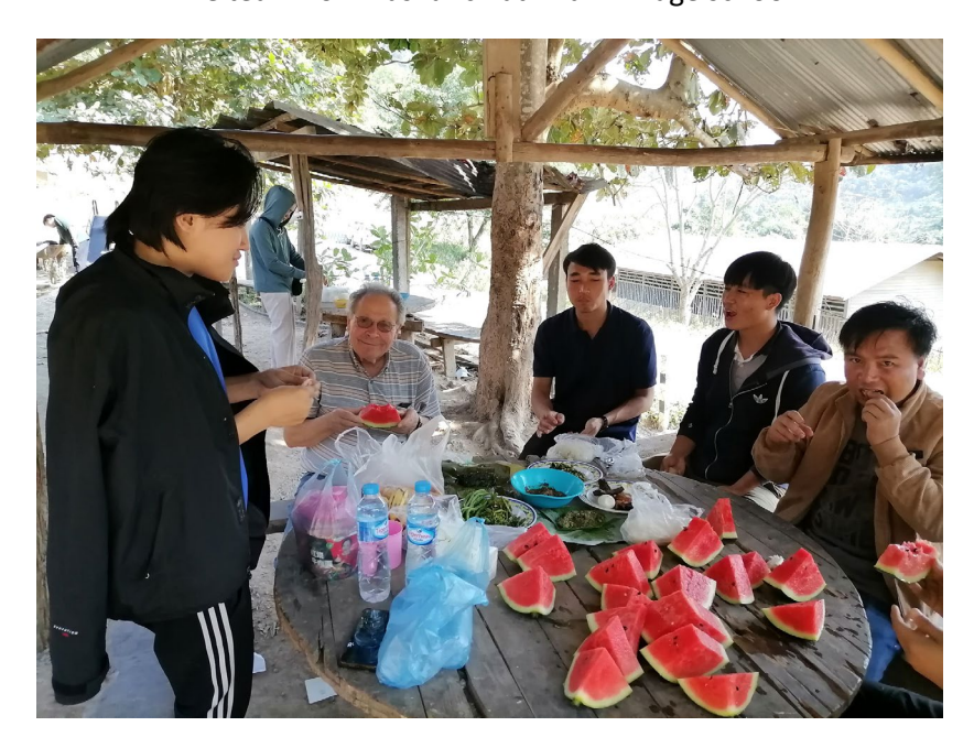
The teamwork has lunch at Kham village school