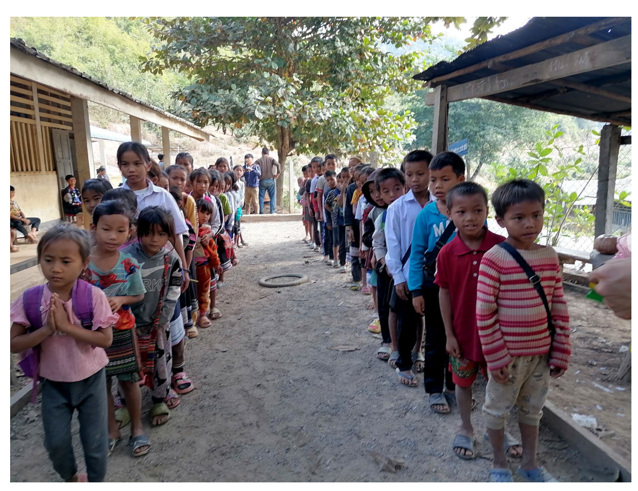
Providing educational supplies to school children At Kham Primary School