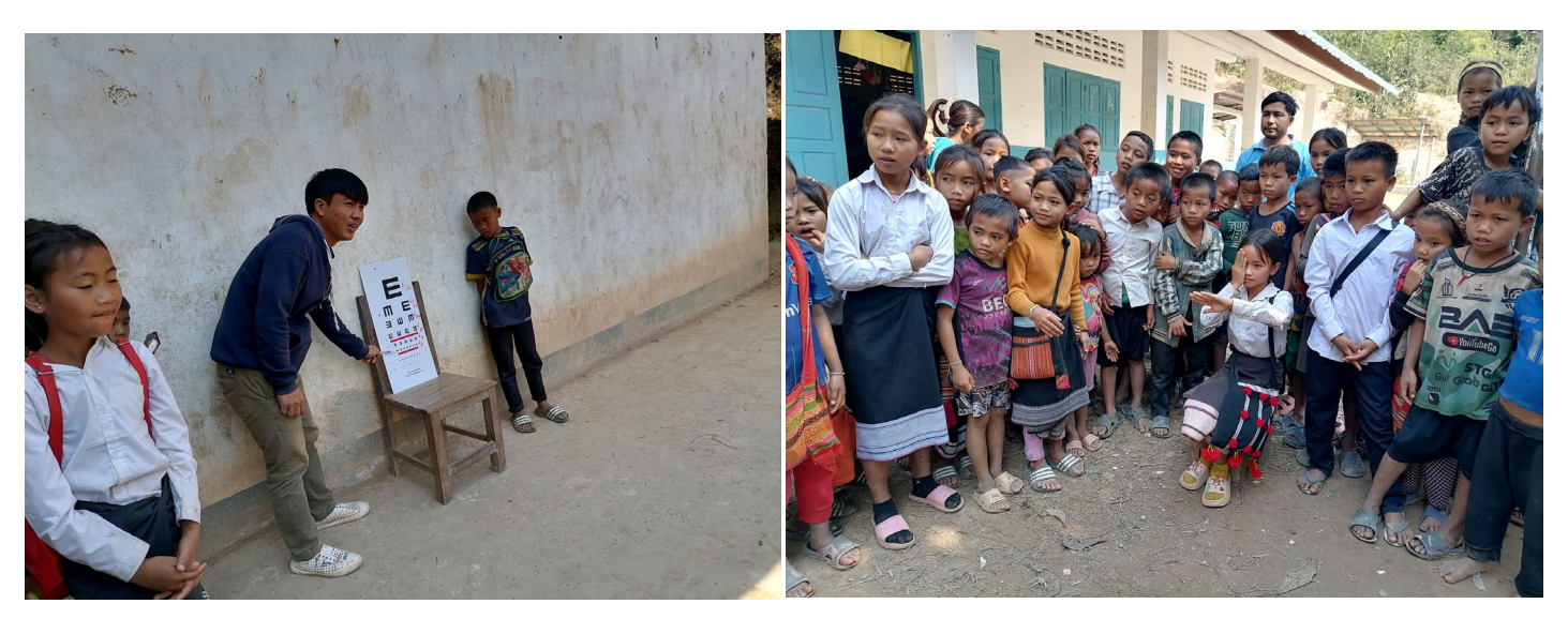
Student vision test by Snellen Chart By Ajee, Ophthalmic nurse