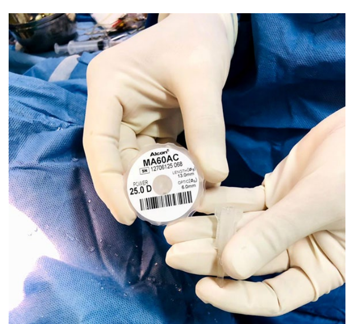
Implant Intraocular lens by Alcon Acrysof Lens