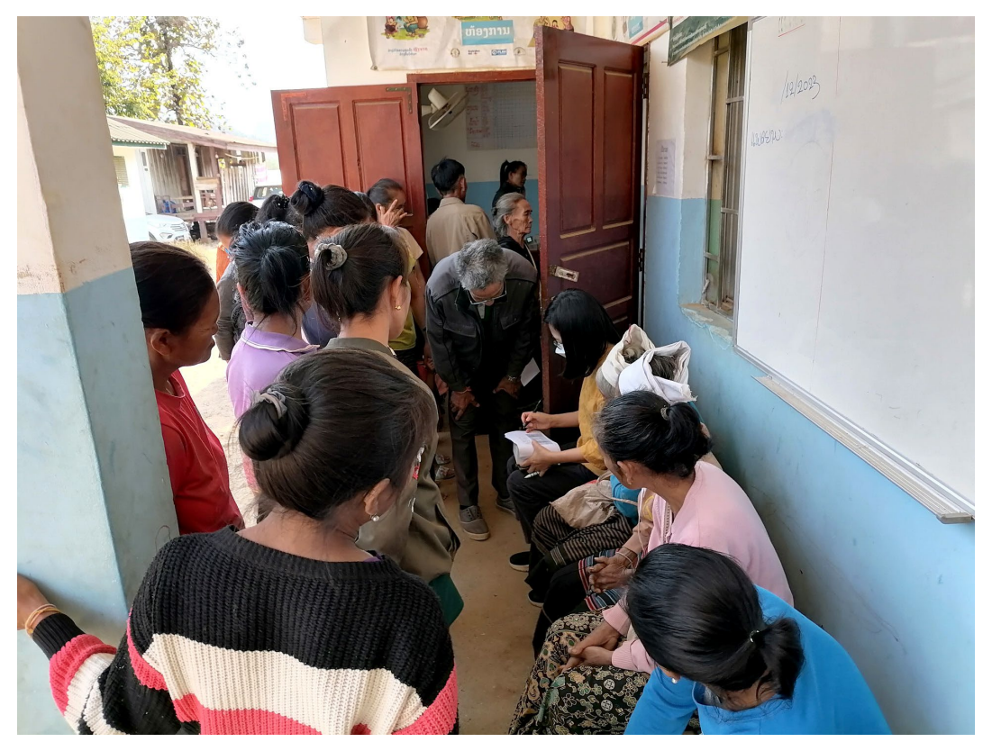
Eye patients registering and waiting to be examined At Saysana Health Center