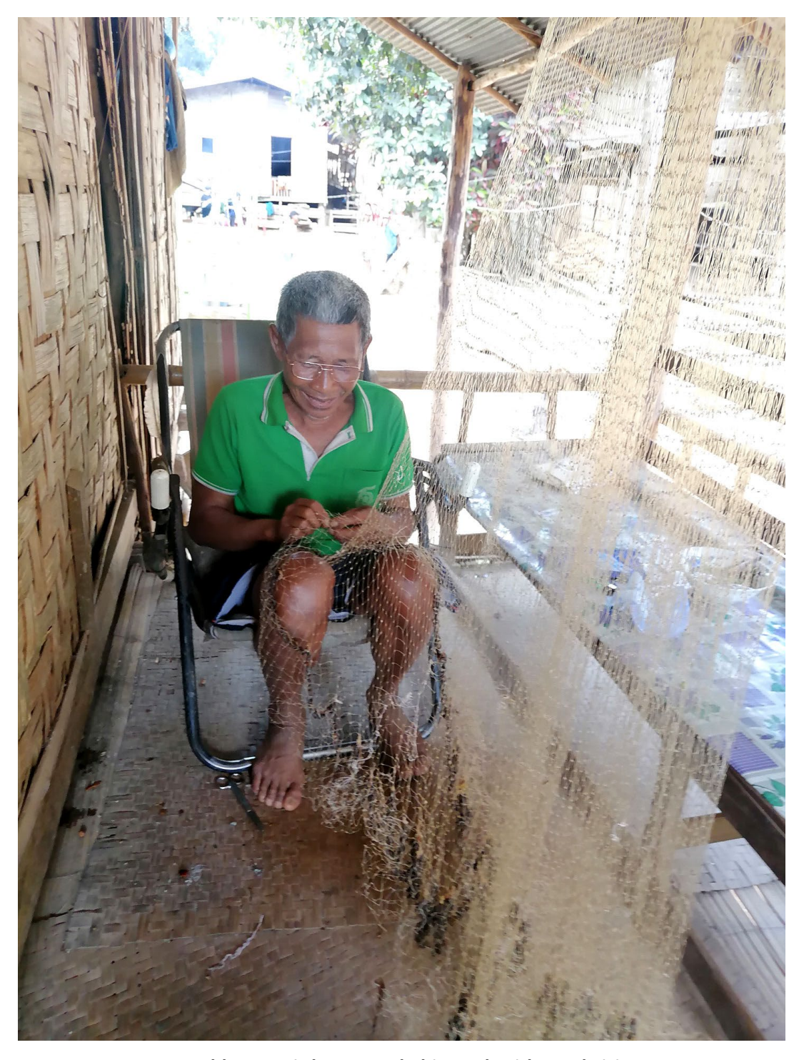
An older man is happy to do his work with good vision After recieving new glasses