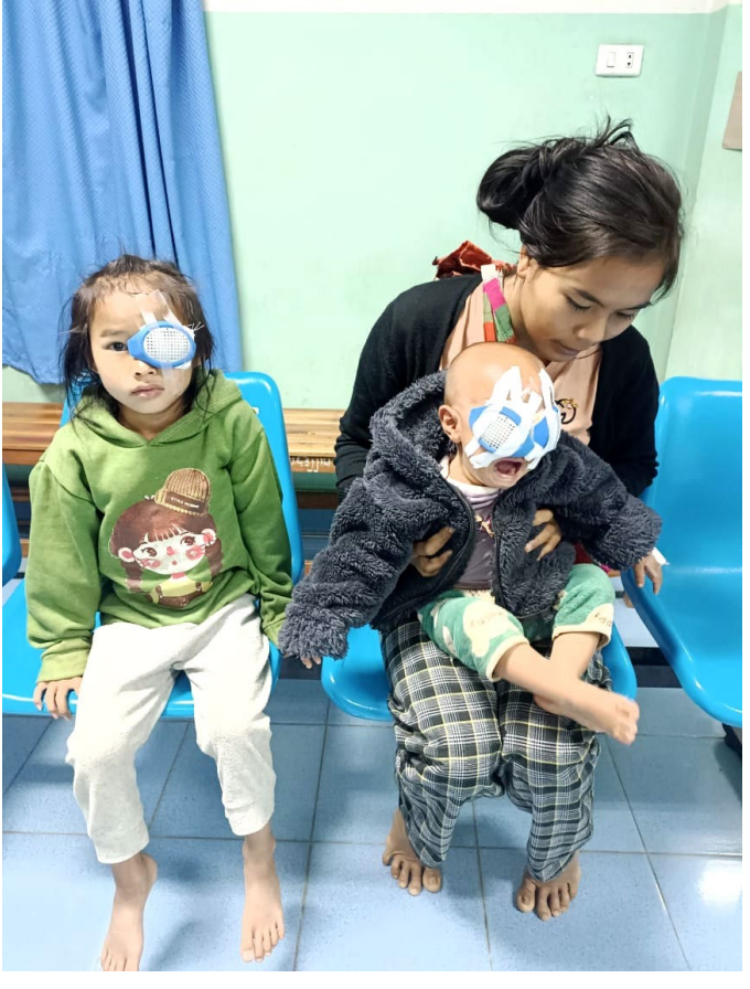
A girl and a boy with congenital cataract post surgery on 1st day