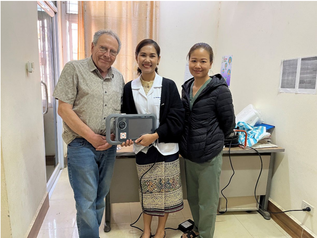
Donation of equipment to Houn District Hospital and patient grateful for new glasses