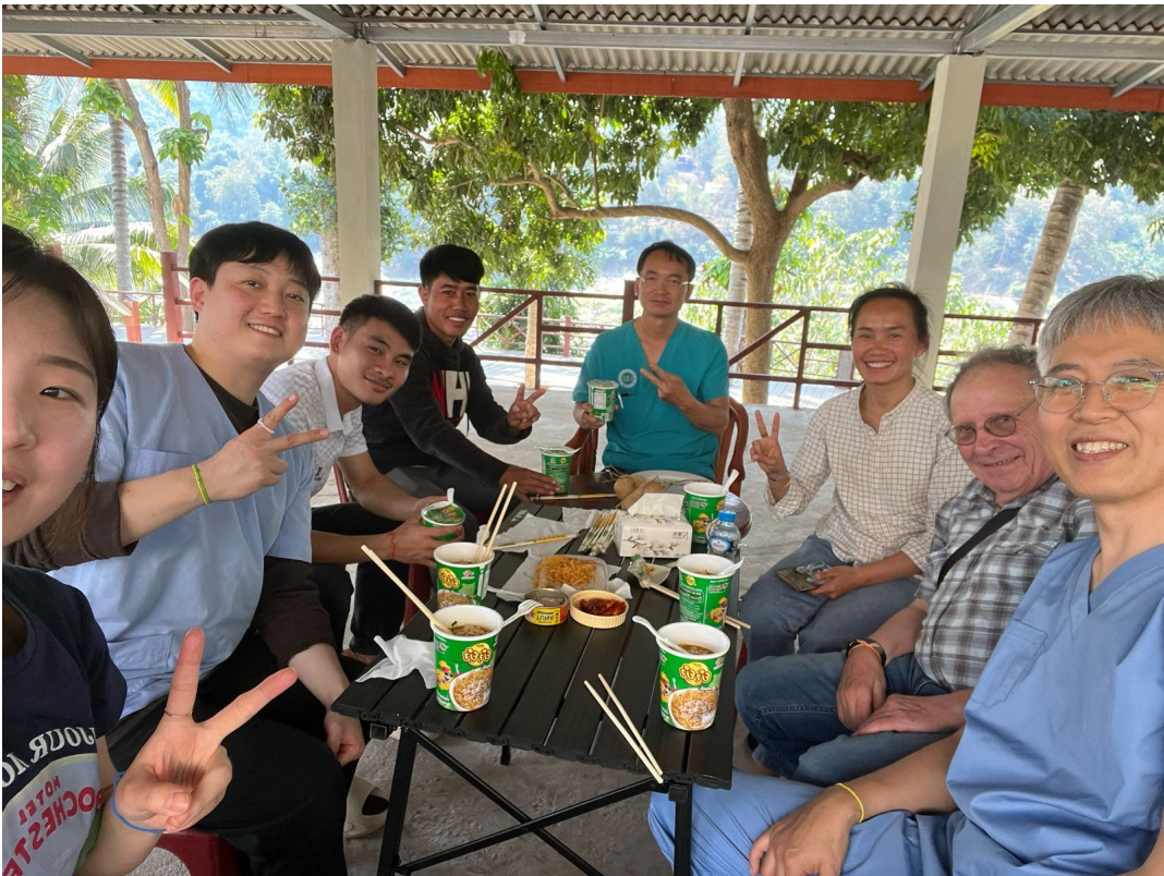
Local woman happy with new glasses and team happy with lunch