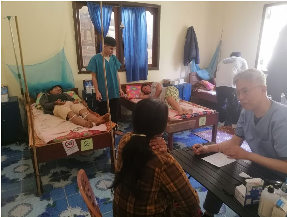
LRF and Korean Teams arriving at Khokha Health Care Center