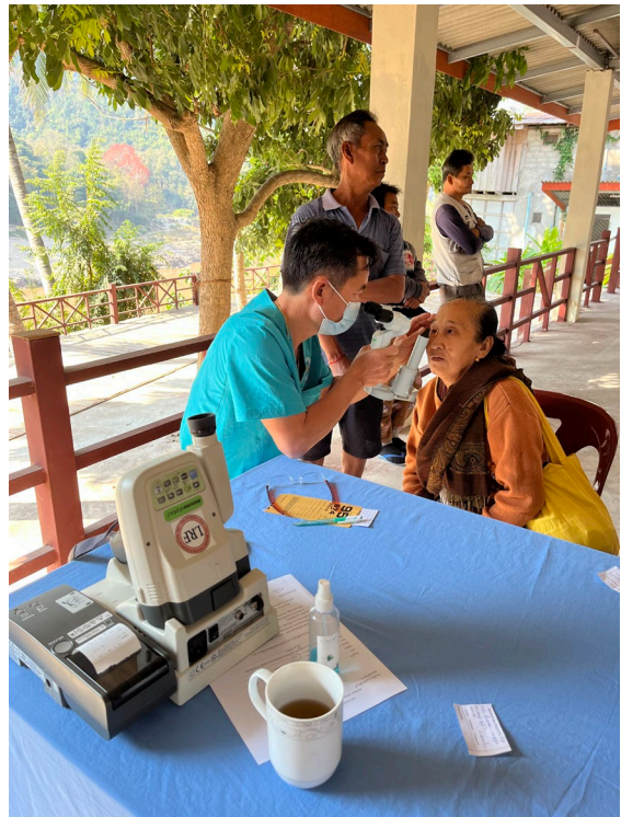
LRF Team checking patients with mobile equipment and providing new glasses