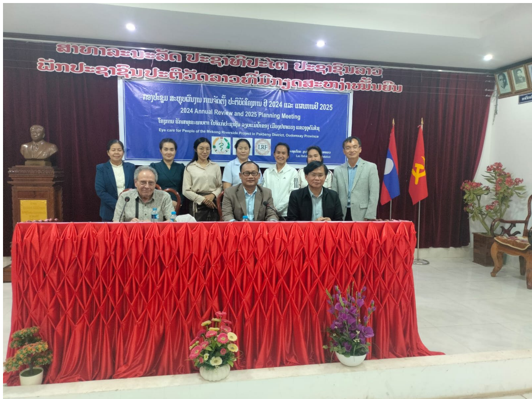
Annual Meeting with Ministry of Health, Foreign Affairs and Oudomxay Province Government