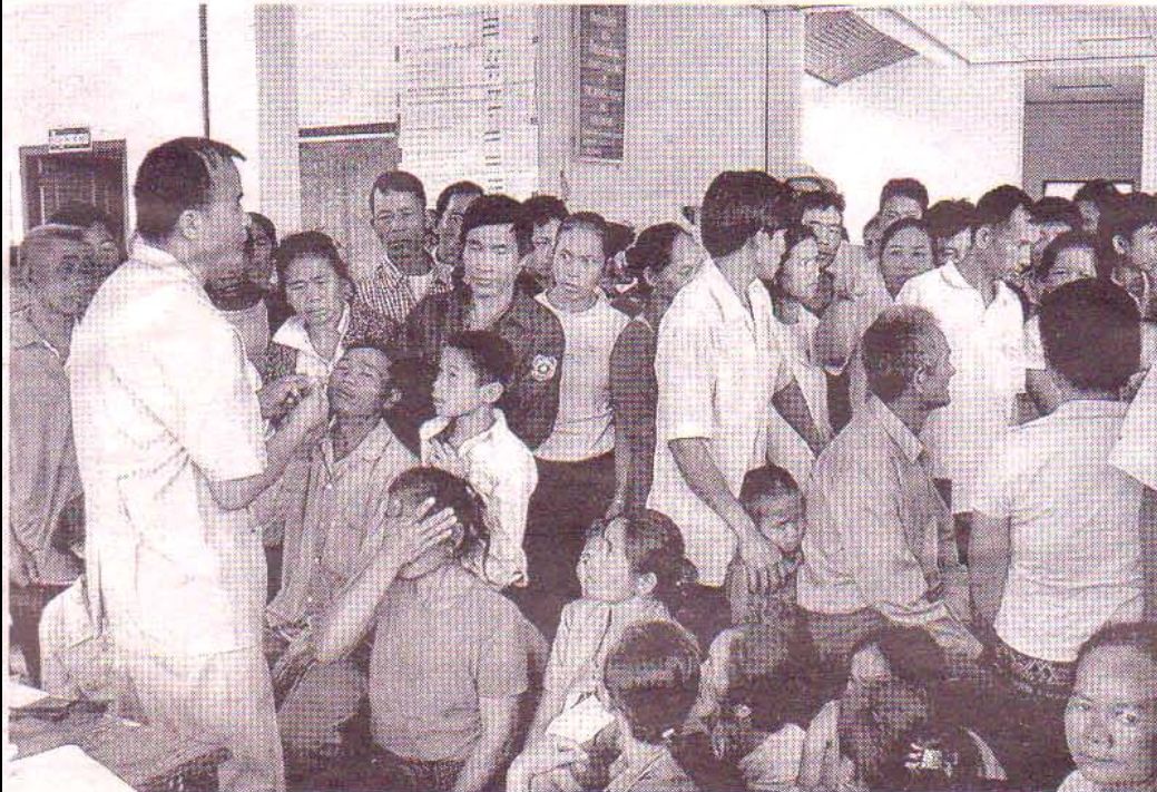
Residents of Baeng district in Oudomxay province queue up to receive health checks.

On the same occasion the LRF donated a mobile dental unit to Oudomxay Provincial Hospital, valued at more than US$8,000 (about 70 million kip).