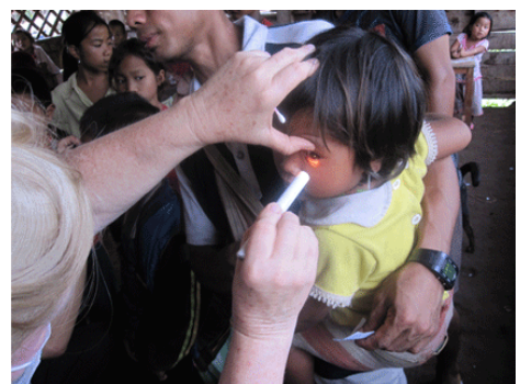
Screening Trachoma for Khamu and Akha ethnic children