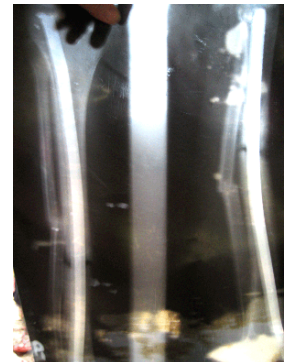
Film X-Ray Tibia and Fibula fractured (Front & Beside)