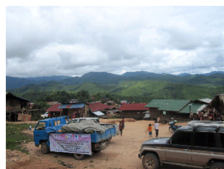
At NamYang (Akha) Village