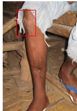
The scar below the knee