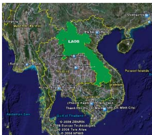
Map of Laos

The three Northern provinces of Phongsaly, Luang Namtha and Oudomxay are 85% high mountain regions. With a population of 576,436, many people are poor and live in remote area. They subsist mainly on agriculture, and have only limited access to healthcare, particularly eye, E.N.T. and dental care.