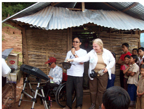
Blind musician with blind singer are singing a song on the mobile health care at NamYang village and have someone collecting money to help blind singer