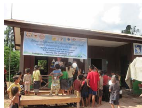
At Donmai Health Center