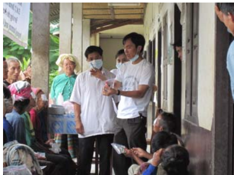
Doctor advises patients how to take medicines and how to take care by themselves for post-operated cases