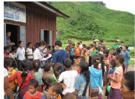
Dentists advise children how to clean teeth using toothbrush