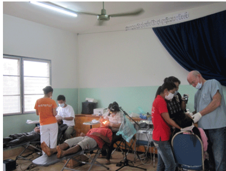
Dental examination and treatment