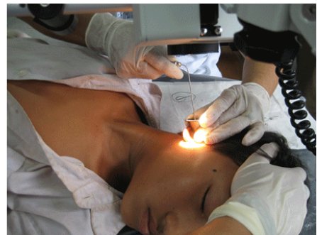
E.N.T examine and service