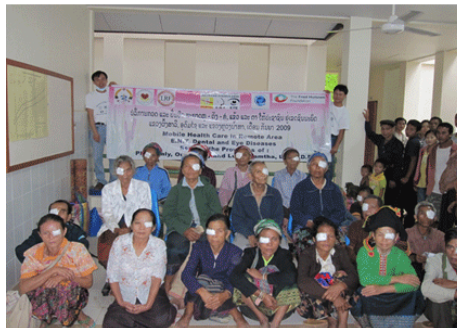
Postoperated cataract 1 st day