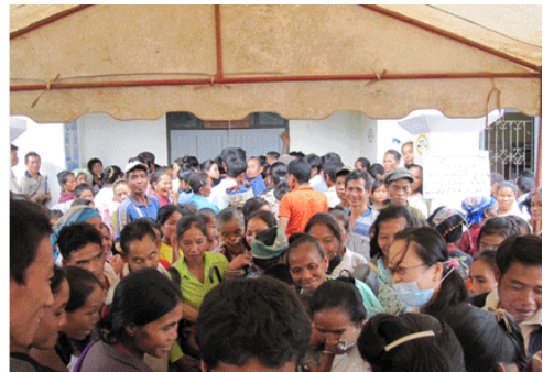
The patients are waiting to register and be examined for E.N.T, Dental and Eye diseases In Namor district, Oudomxay province