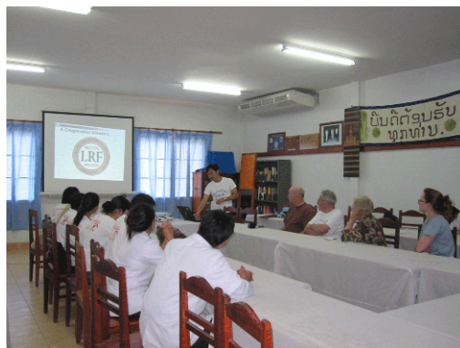
Present the activities, result and outcome of the mobile health care service in meeting room of Luang Namtha provincial hospital