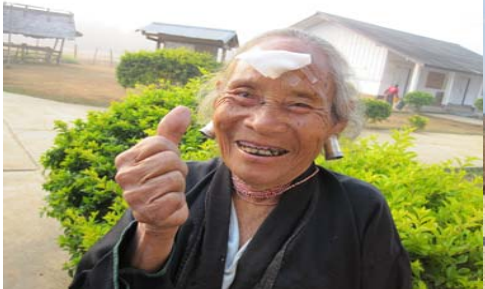
Cataract post-operated case 1<sup>st</sup> day Is happy with good vision (Museur ethnic)