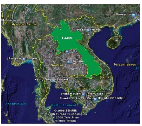
Laos and Bokeo provinces map

The public health system includes 1 provincial hospital, 1 military hospital, 5 district hospitals and 30 health care centers.