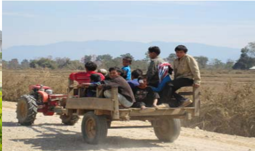
Cataract post-operated case (Go back home by tractor)