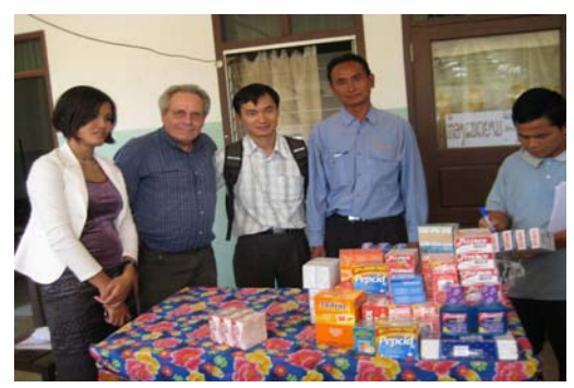
Donated medicine for Pha-Udom district hospital