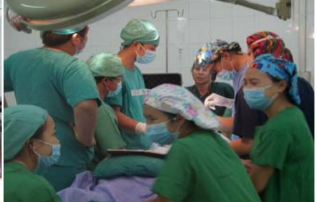
US joint Lao team to operate cleft lip in operation room