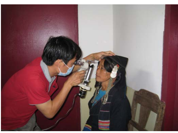
Eye examined with mobile slit lamp