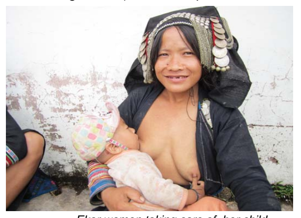
Ekor women taking care of her child while waiting to be examined