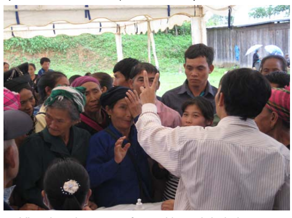
Visual acuity test performed by ophthalmic nurse