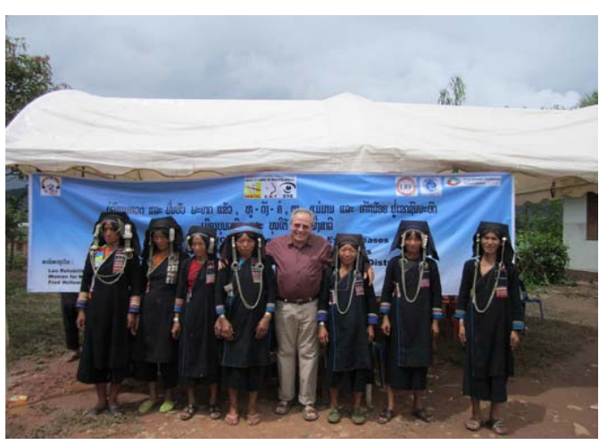
Ekor ethnic meet the team for health check

The team provided service to all patients, with no regard to gender, age, ethnicity or religion. Services were free of charge for all patients 3,056 cases.