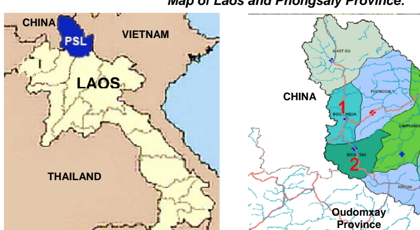
Map of Laos and Phongsaly Province:

The population of 166,635 consists of many ethic groups such as Khmu, Yao, Phounoy Hor, Ekor, Akha, Tai Dum, Leu, Hmong and others, each with their own identity, culture, traditions, costumes and languages. The majority of people living in remote areas are poor. The struggling economy is mainly farming and agricultural; tea being the main export.