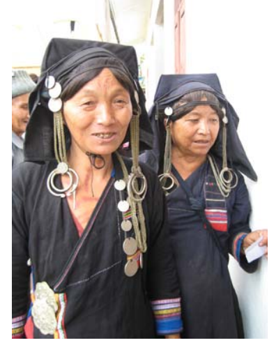
Patient are waiting to be examined under heavy rain