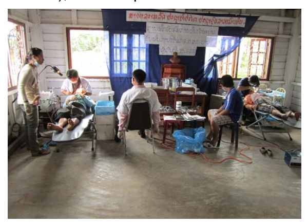
Dental patients are examined and treated