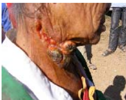
Case tumor (skin cancer)