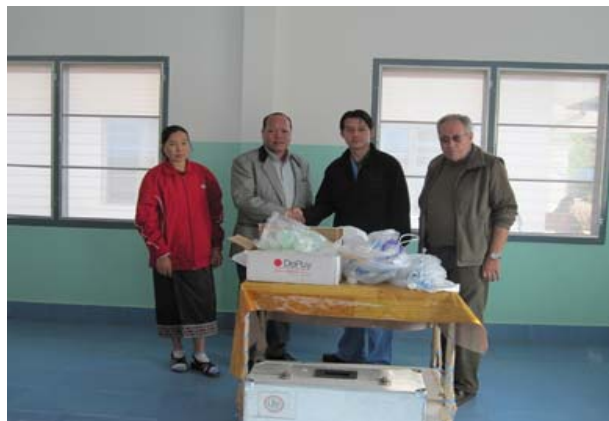
LRF Donated ENT surgical microscope and equipment for operation room