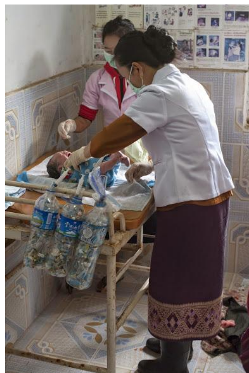
Nurses (local staff) taking care of a newborn baby