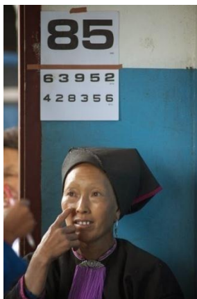
Patient tested for visual acuity