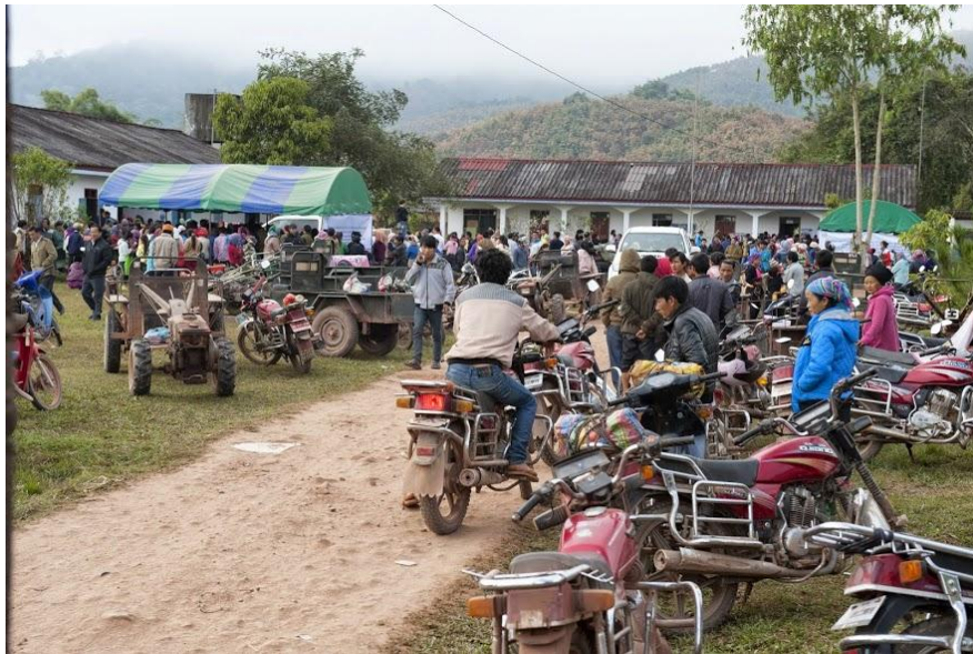
Patients registering and waiting to be examined at Yord Ou district hospital