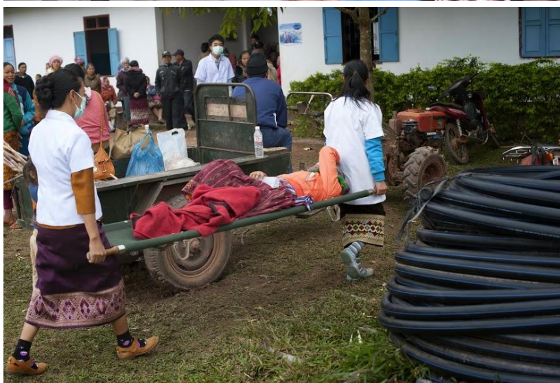
Nurses (local staff) taking care of emergency