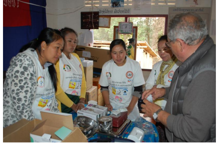
how to use surgery and delivery set at Ban Yor health center