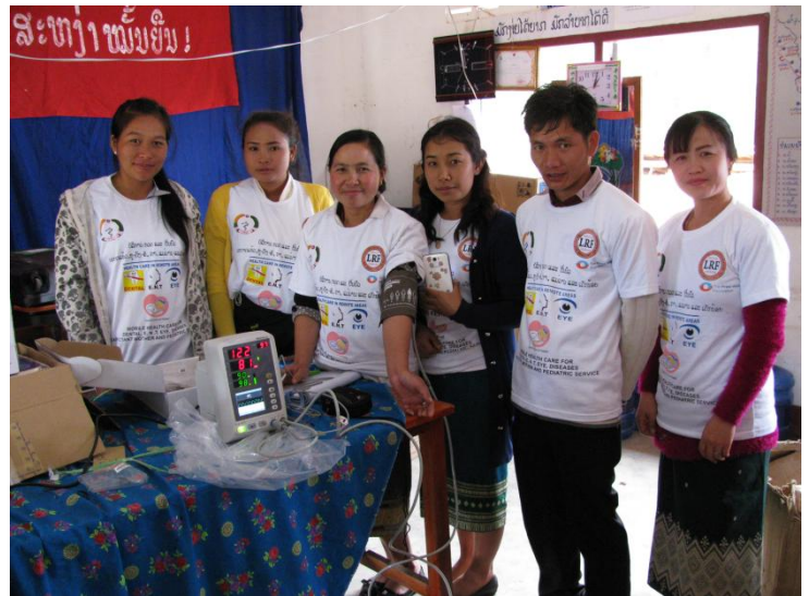
Ban Yor health center staff receives medical supplies from Lao Rehabilitation Foundation