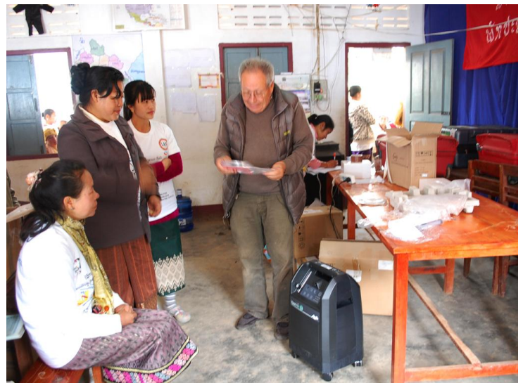
to Bountai district hospital