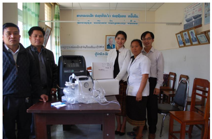
to Khoua district hospital