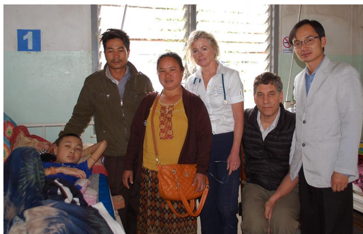
A boy with his parent and LRF team at Oudomxay provincial hospital