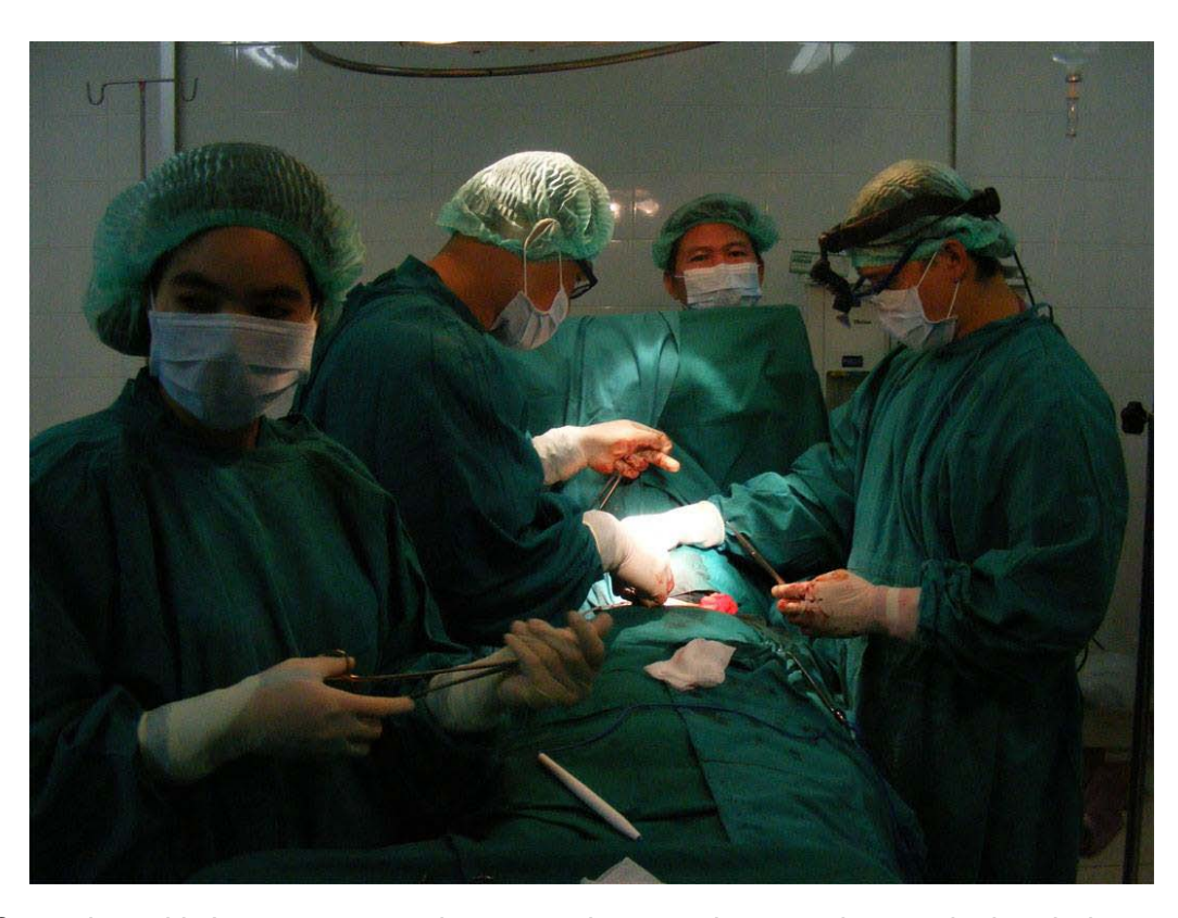
Operating with Lao surgeons, demonstrating step by step the surgical techniques to perform safe thyroidectomy. Our goal was teach the local surgeons to perform these surgeries and become self-sufficient to make our surgical missions sustainable