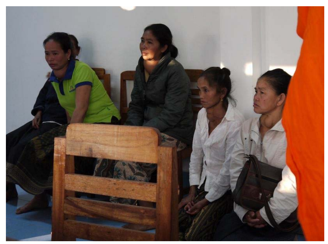
Thyroid patients waiting to be examined. We found a large number of patients with toxic multinodular goiters. Iodine deficient goiters from hypothyroidism were rarely seen.