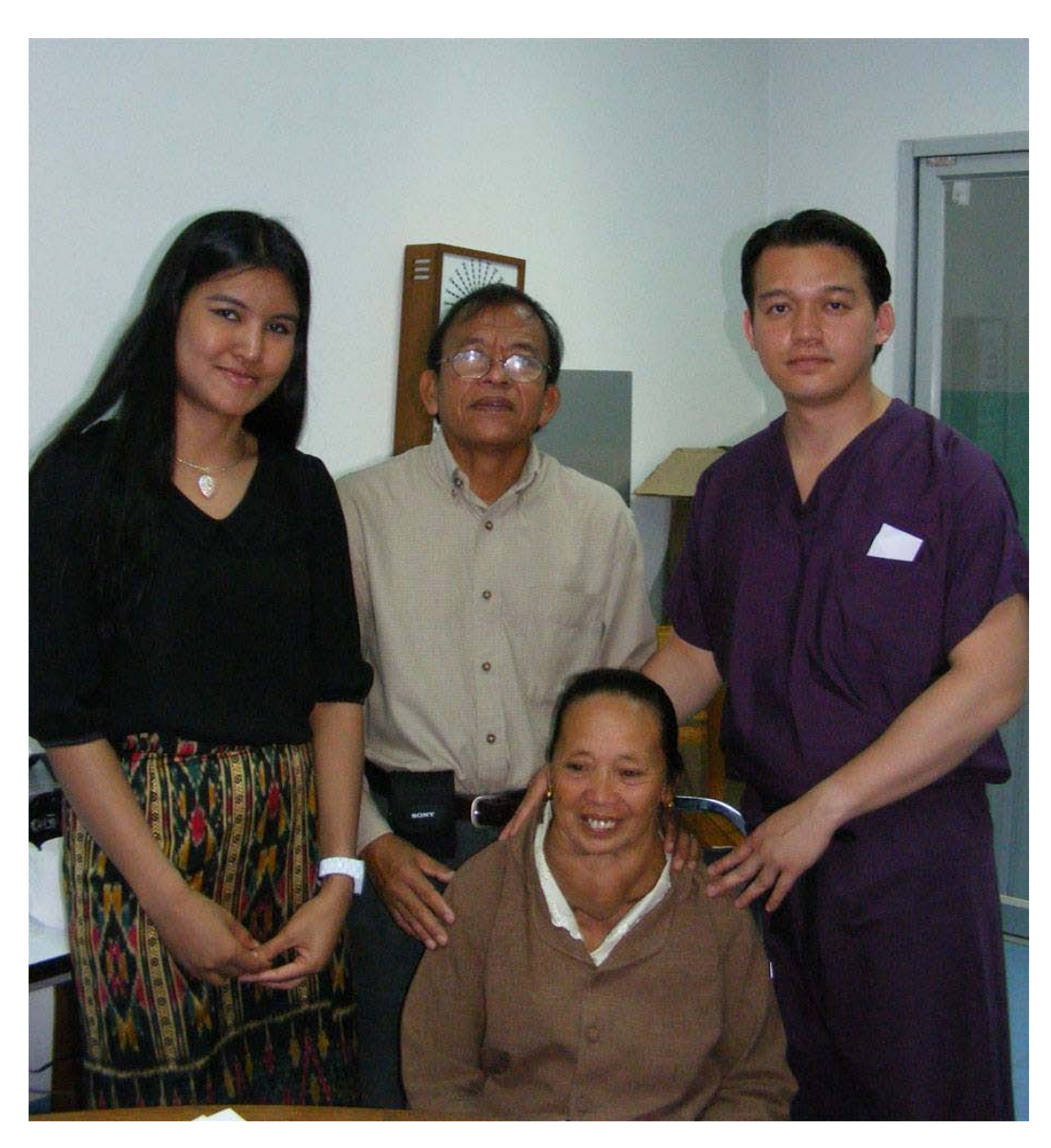
Examining a Thyroid Goiter Patient