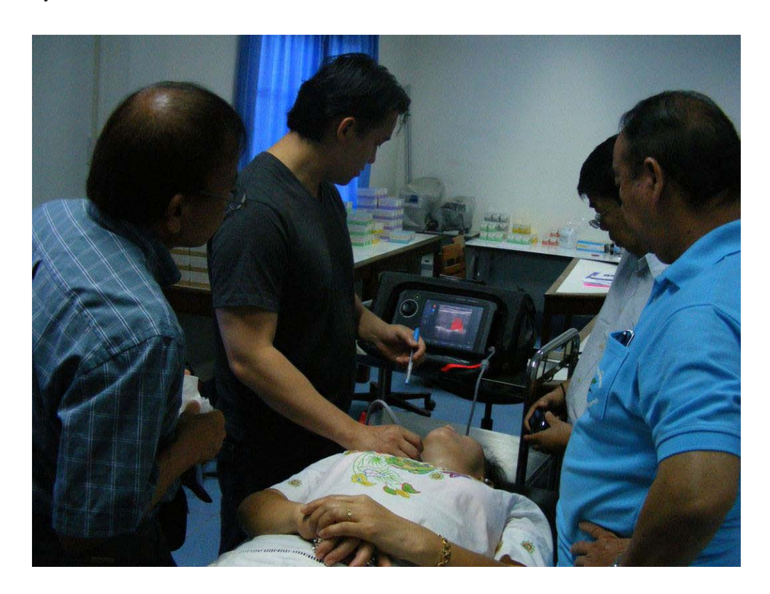
Demonstrating Thyroid ultrasound to examine for thyroid pathology, general thyroid size, and any tracheal deviation from goiter