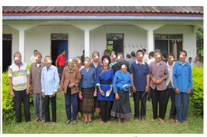
Cataract post-surgery 1<sup>st</sup> day In Yord-U district, Phongsaly province