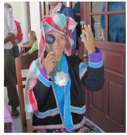
Visual acuity test