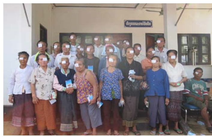
Cataract post-surgery 1<sup>st</sup> day In Huixay district, Bokeo province