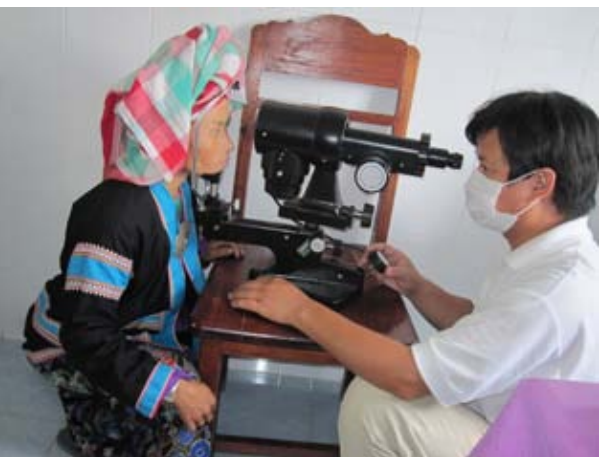
Keratometer test, cataract case