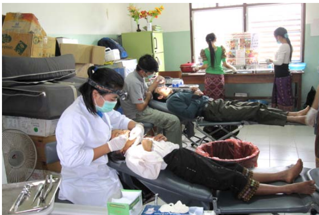
Dental patients are examined and treated.