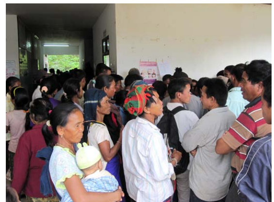
Patients waiting to be examined.