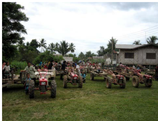
Patients travelling by tractor to get healthcare.