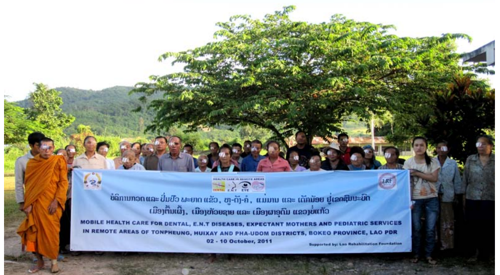
Cataract post-surgery 1 st day at Huixay (Bandan) district hospital.

– Primary eye care health education and post-operative procedures