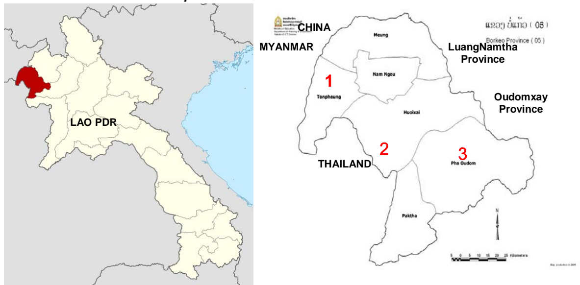
Map of Laos and Bokeo Province:

The public health system is extremely underdeveloped. There is only one provincial hospital, one military hospital, five district hospitals and 31 healthcare centers providing service to the entire population. The challenge of proper healthcare is exasperated by the remoteness of villages and by the public health system's limited access to medical doctors and diagnostic equipment.