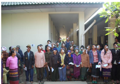
Cataract post-surgery 1 st day at Houn district hospital.