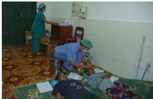
Cataract patient pre-surgery press tension, after local anesthesia by retrobulbar block