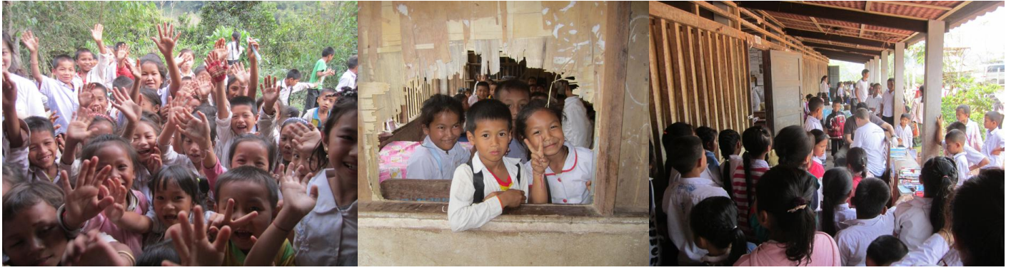
Students, at primary school