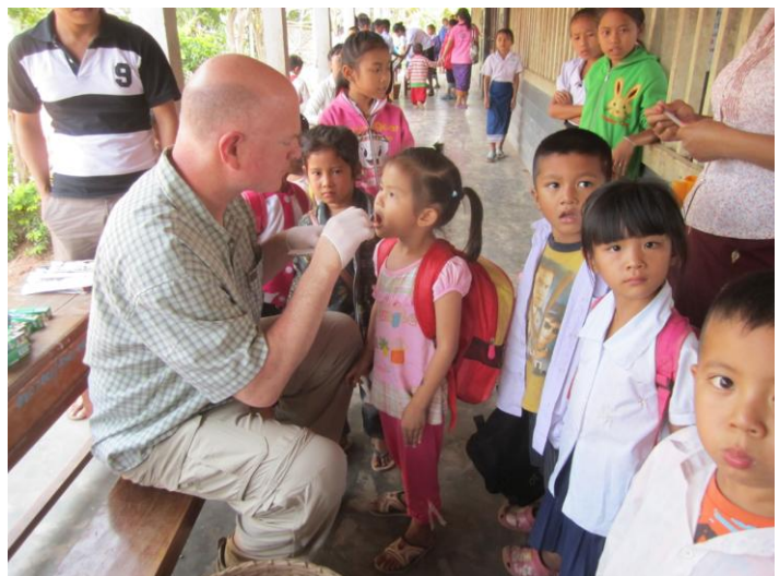
Student examined at 2 primary schools (Pakbeng district) by LRF team