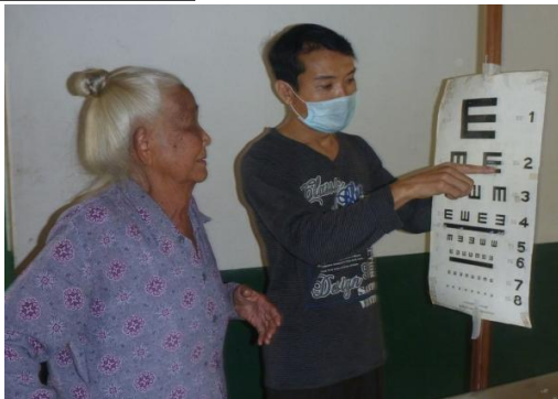
Visual Acuity test E-chart by Khamtan, Ophthalmic nurse