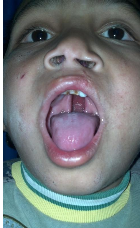
A boy 5 years old with cleft palate