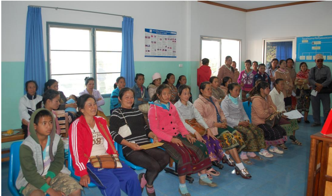
Patients waiting for exam