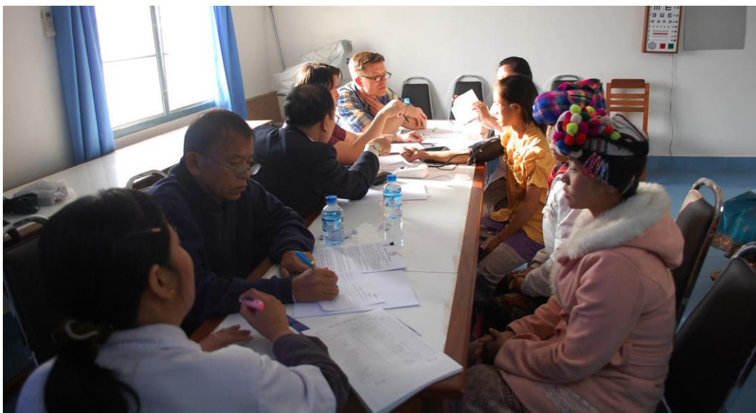
Endocrinologists, Surgeons and anesthesiologist are examining and recording patient data in OPD room