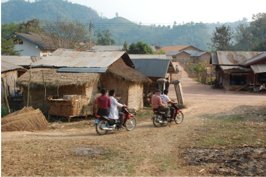
President and coordinator of LRF visiting the village by motorcycle