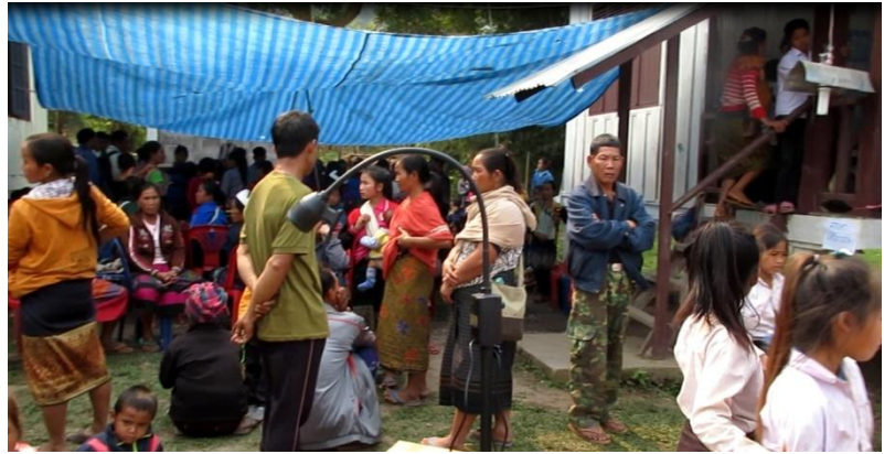
Patients registering and waiting to be examined at Bankhon health center