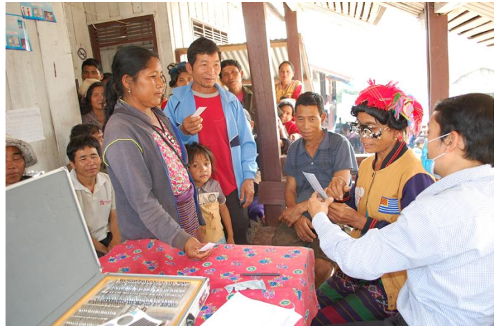
Near Visual test for donation of glasses