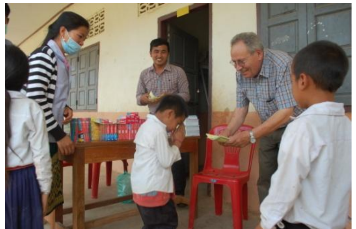
All children received fluoride varnish application with distribution of toothbrushes, toothpaste and educational supplies