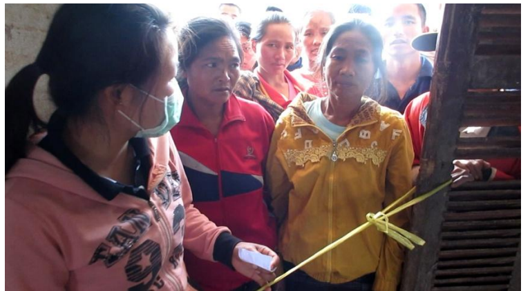
Patients registering and waiting to be examined at Nahom health center