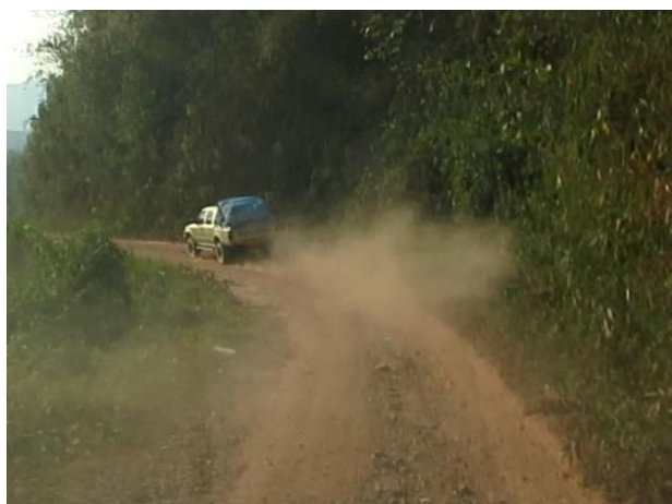
The road to health centers BanKhon and Nahom health centers