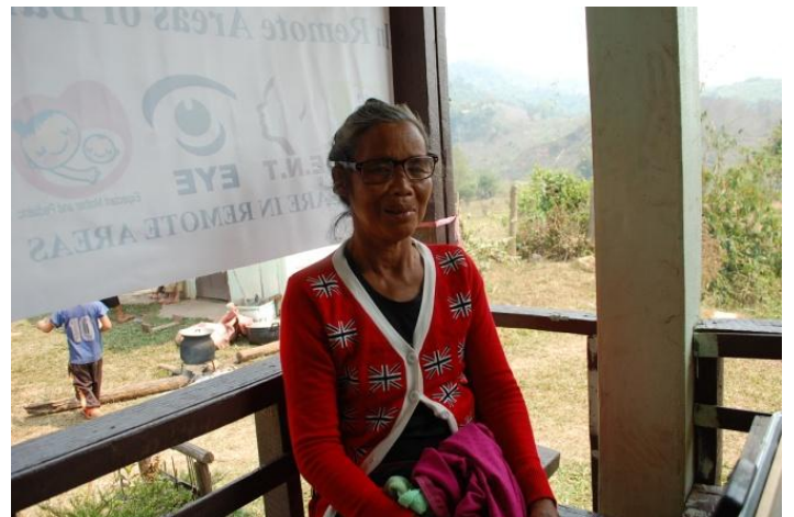
Donation of glasses (near and distant)