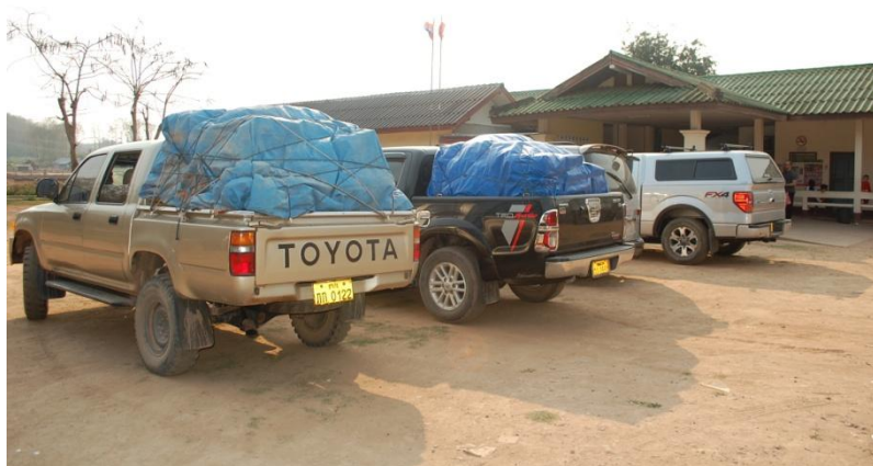
3 vehicles with full medical equipment and supplies in front of Beng district hospital