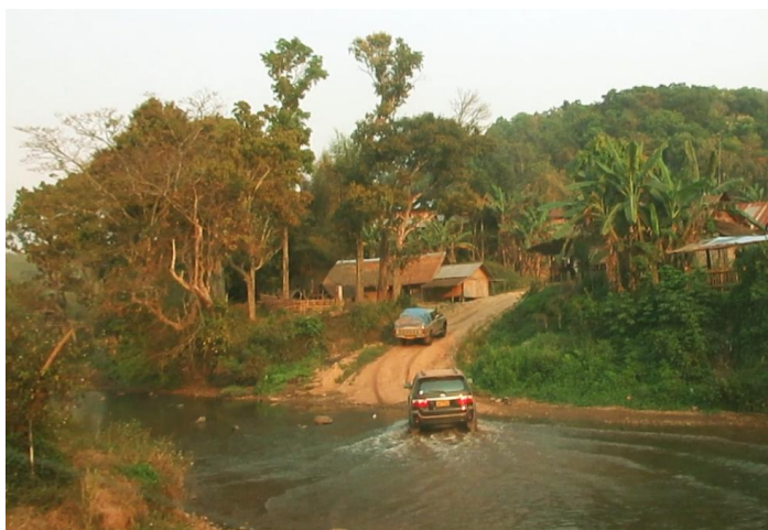
The road across the river to BanKhon health center