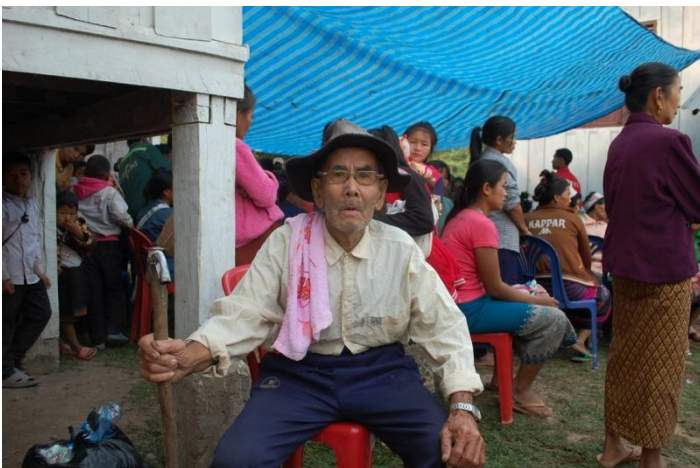
Old patient waiting to be examined