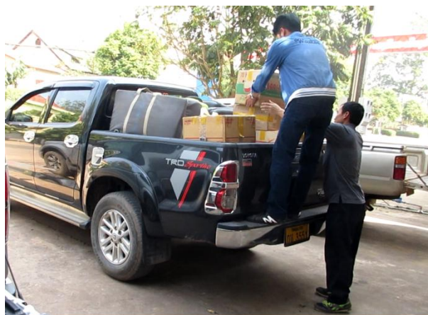
Setting up medical equipment and supplies in the 3 vehicles (Ford F-150, Toyota Vigo and Toyota Hilux)