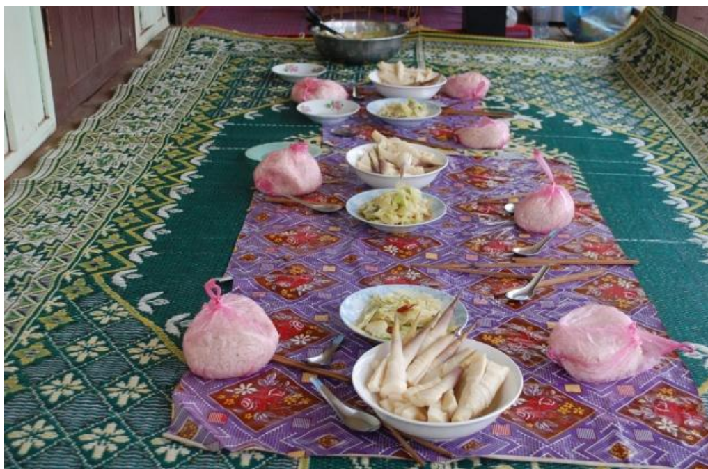
Luncheon for the team