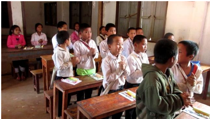
Teacher is providing dental care education on how to use toothbrush with toothpaste at Nahom Primary School