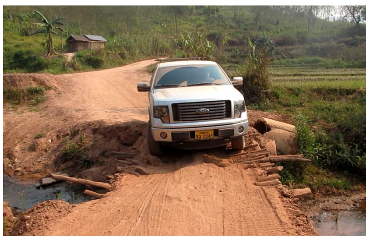
The road across the damaged bridge to Nahom health center