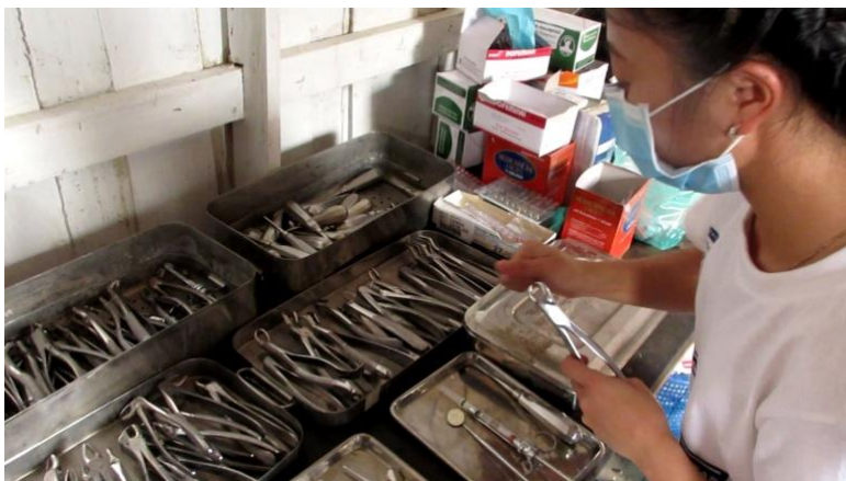
Dental equipment set for dental care