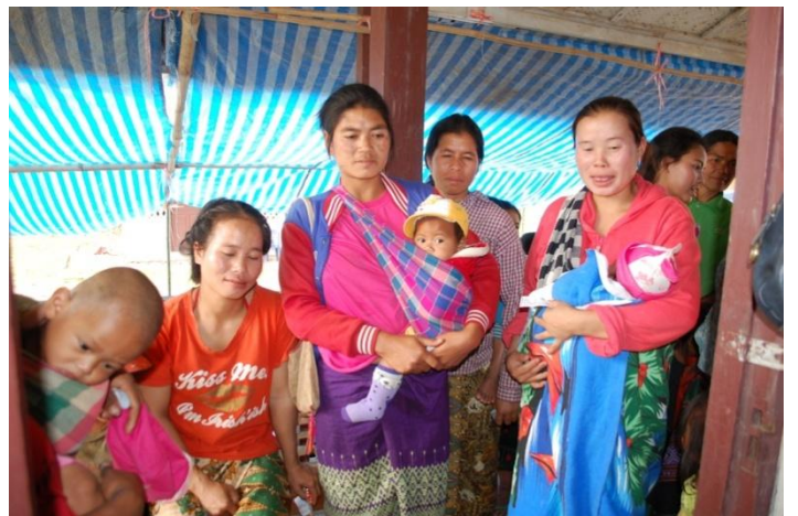
Children with grandmother waiting to be examined