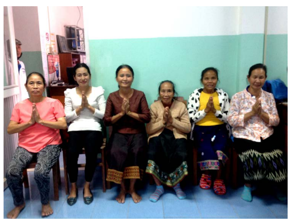
6 DCR patients, post-surgery 2 months