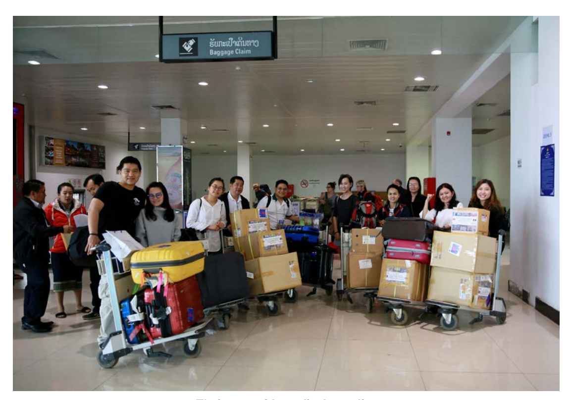
Thai team with medical supplies At LuangPrabang International Airport