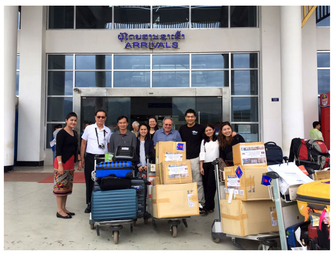
Thai-LRF team with medical supplies At LuangPrabang International Airport