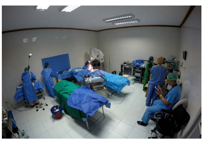
Operation Room (1) For local anesthesia