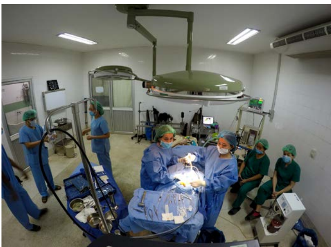
Operation Room (2) For general anesthesia