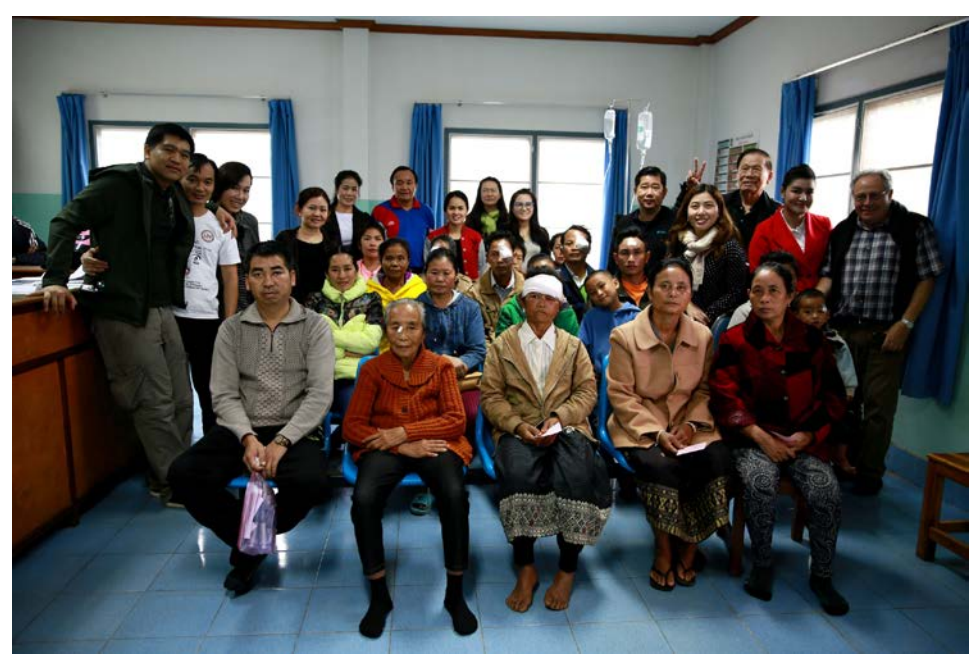
Patients, post-surgery 1<sup>st</sup> day and teamwork