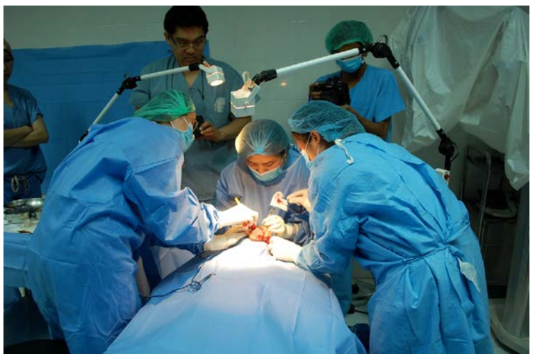
Severe eyebrow mass excision with full-thickness skin graft By: Dr. Aree and 2 assistants