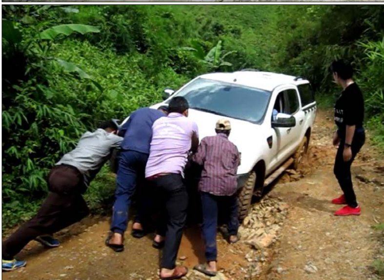
Driving on difficult dirt roads