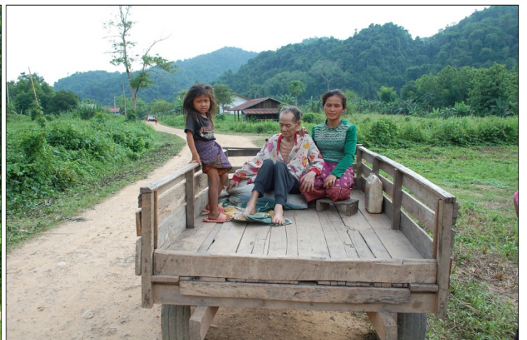
Transportation of patients from surrounding villages by small tractor trucks