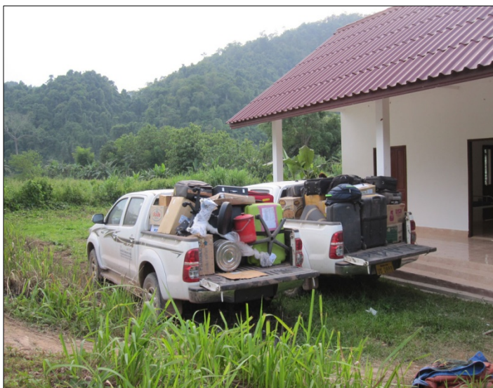
Three pickup trucks carrying doctors, nurses, medical equipment and supplies arriving at the small newly built remote health center of Nasal