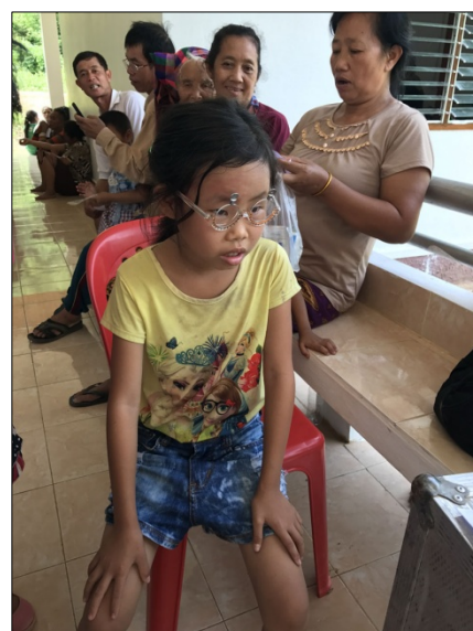
Refractive service with donation of eyeglasses