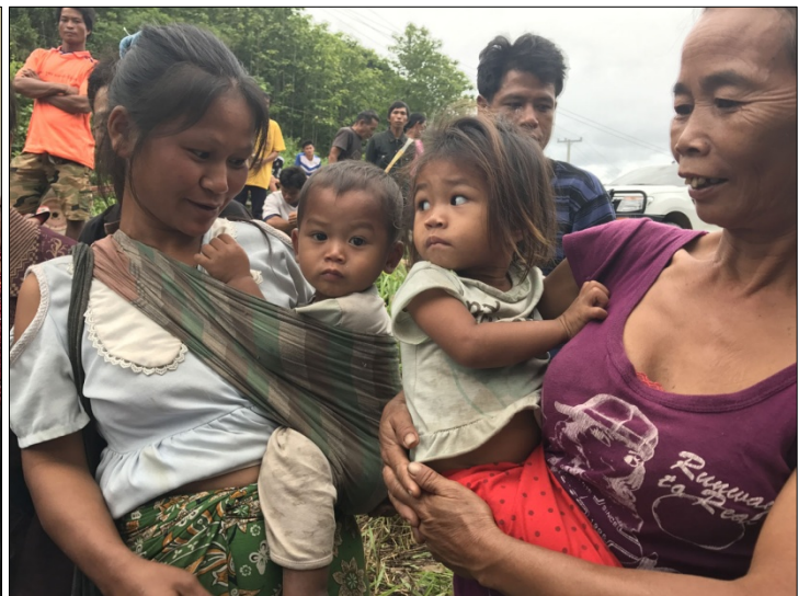
Patients registering and waiting to be examined