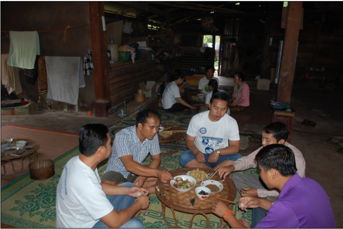
Dinner for Lao team Home staying at Ban Nasal village