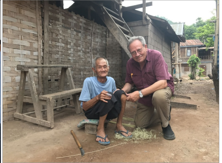
President of LRF spend some time getting to know an elder man at Ban Nasal village