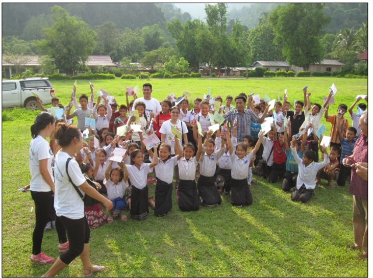
Children at primary school received toothbrushes, toothpaste and educational supplies