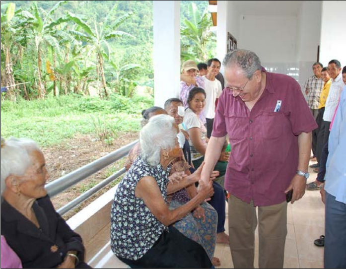
An old woman happy to shake hands with the President of LRF Cataract post surgery 1 st day