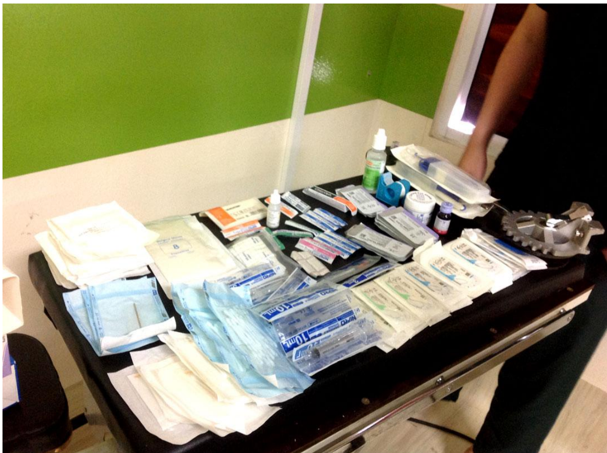
Medicine and supplies for surgery