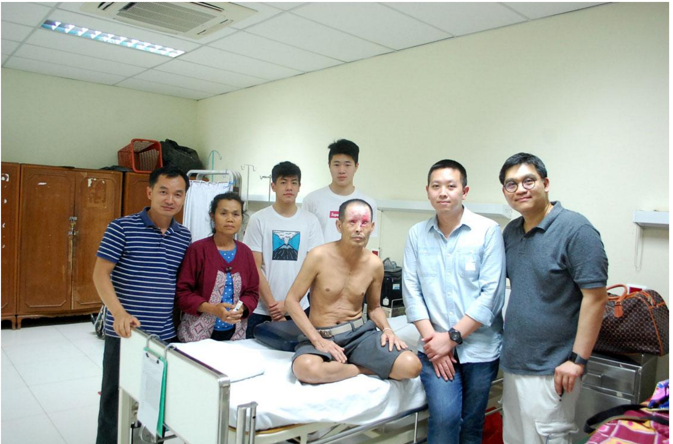
A man with eyelid lost by burn, his wife and team before surgery