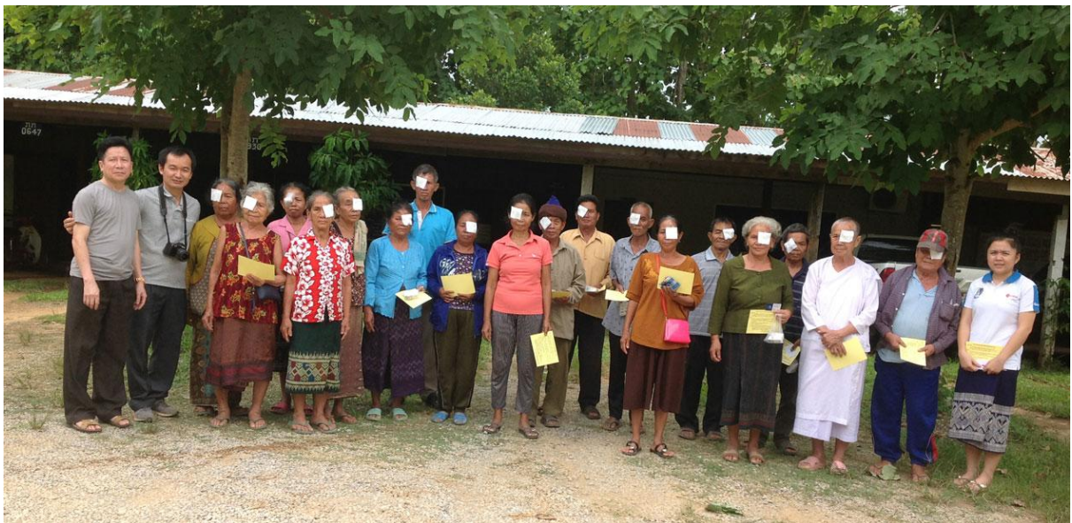
Cataract post-surgery 1 st day