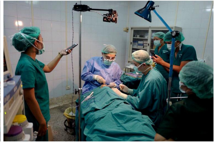
A little girl with lower lid retraction and ectropion repaired by Z-plasty technique