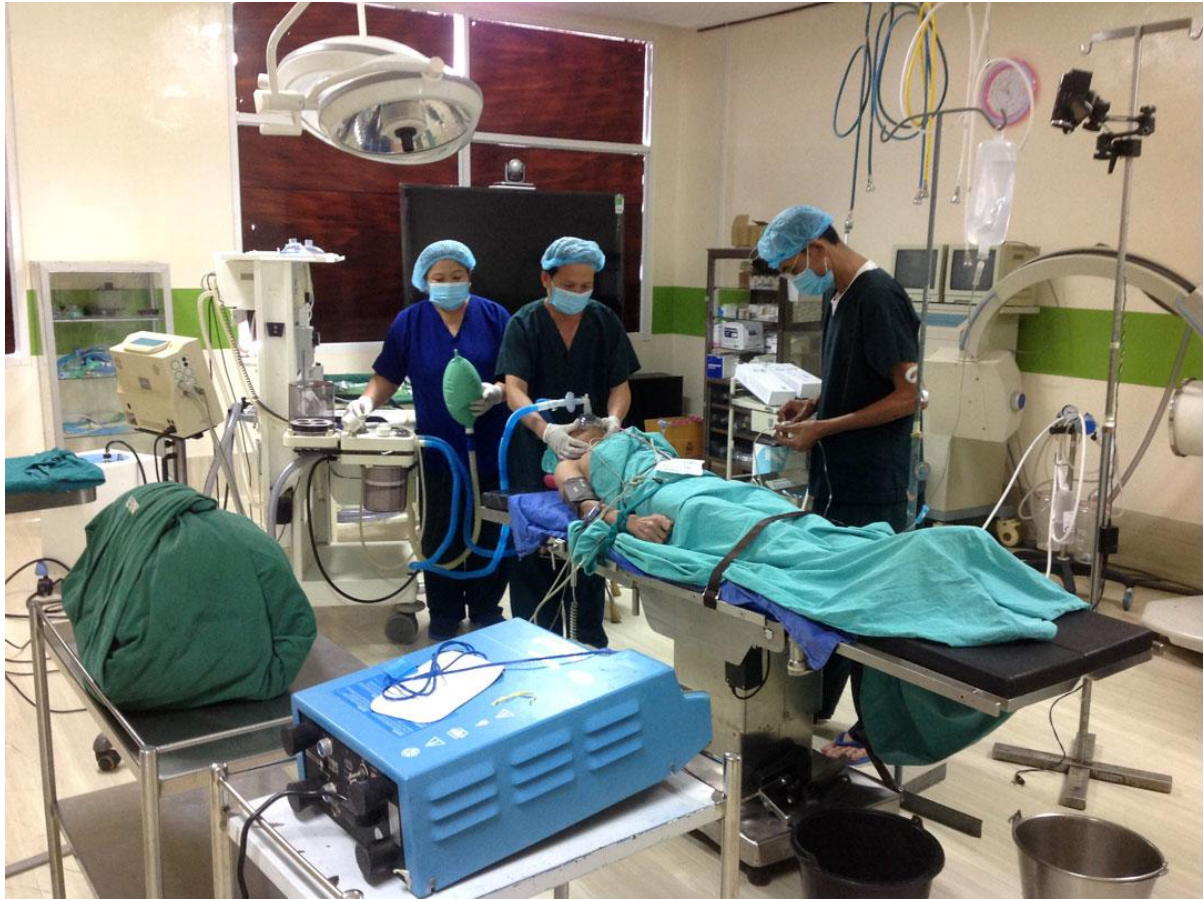
Anesthesia team are setting up patient pre-surgery