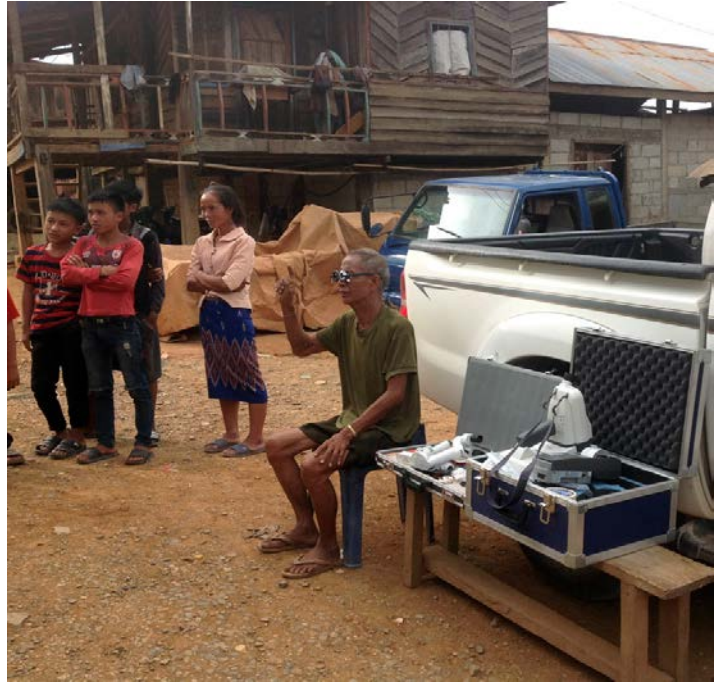
Patients visual acuity test 6 weeks post surgery At home of a patient, in Houn district