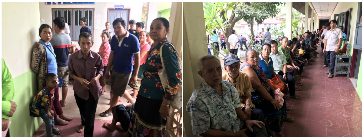
Patients registering and waiting to be examined at Houn and Beng district hospitals