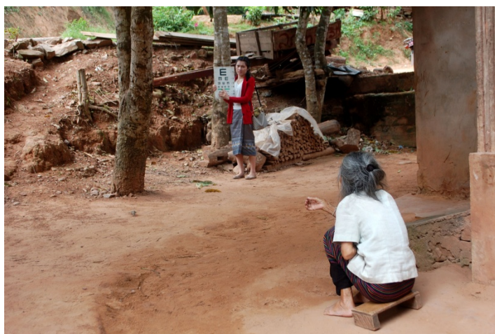
Patients visual acuity test 6 weeks post surgery At the patients' home in Beng district