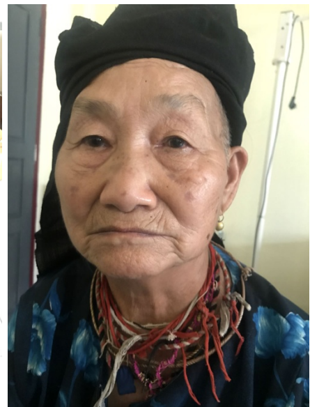
Patients are happy with good vision on first day post surgery