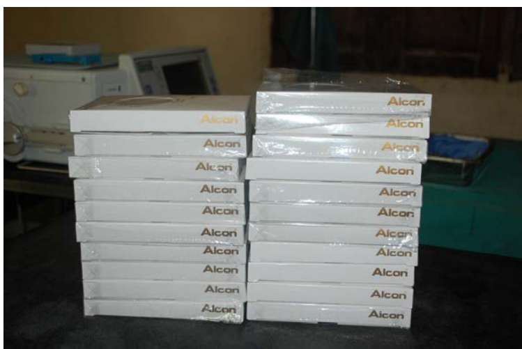
Foldable IOL , supported by SEE International