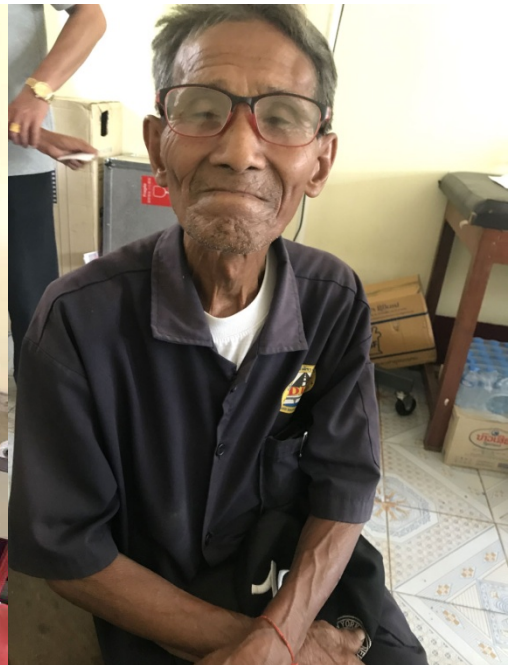
Patients are happy with good vision after donation of glasses