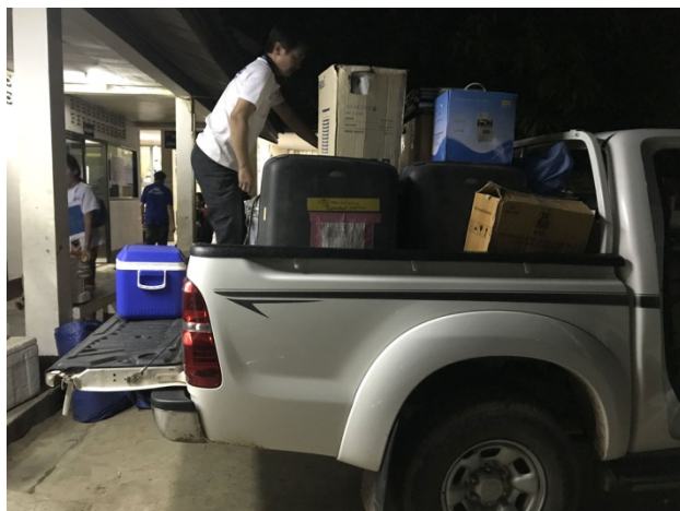
The pickup truck carrying medical equipment and supplies