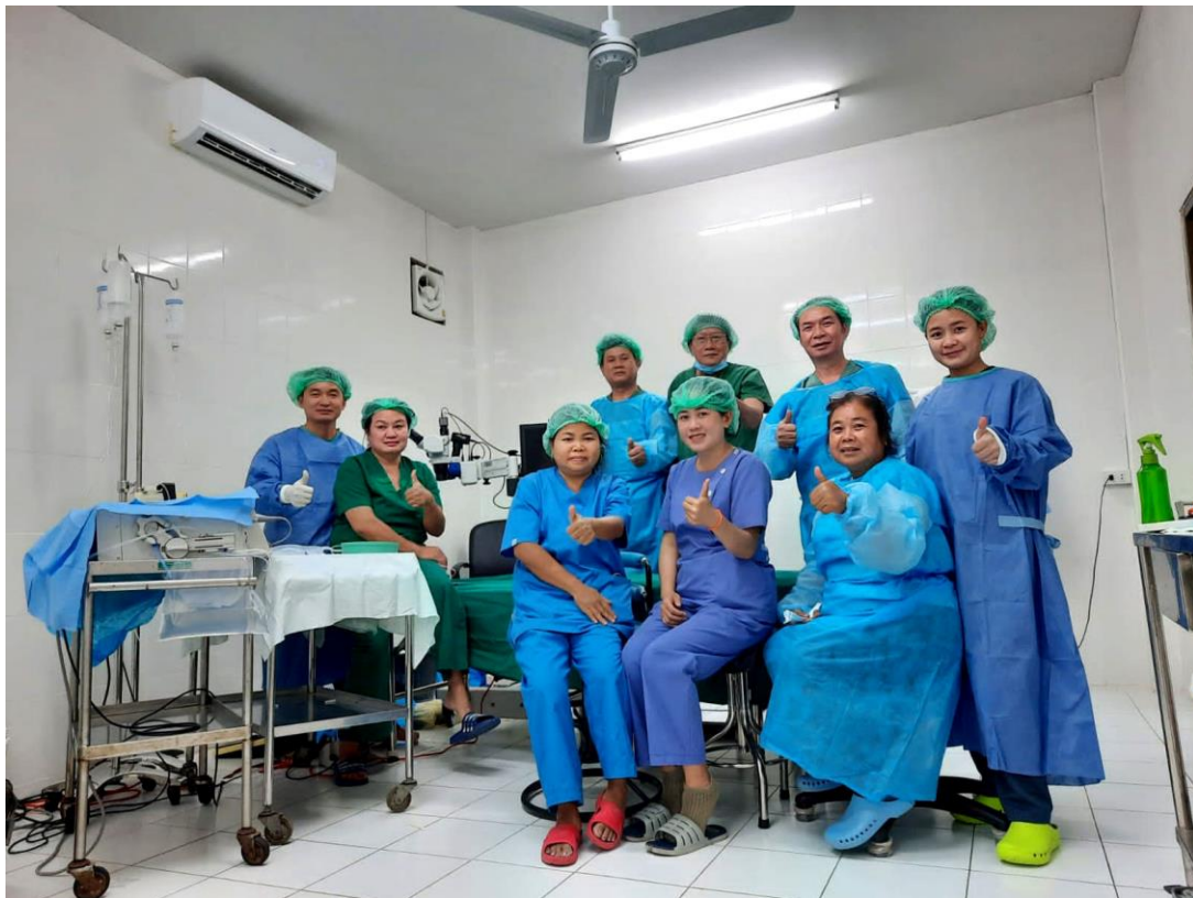
Teamwork (ophthalmologists and ophthalmic nurses) on the last day of training at LuangPrabang Eye Unit