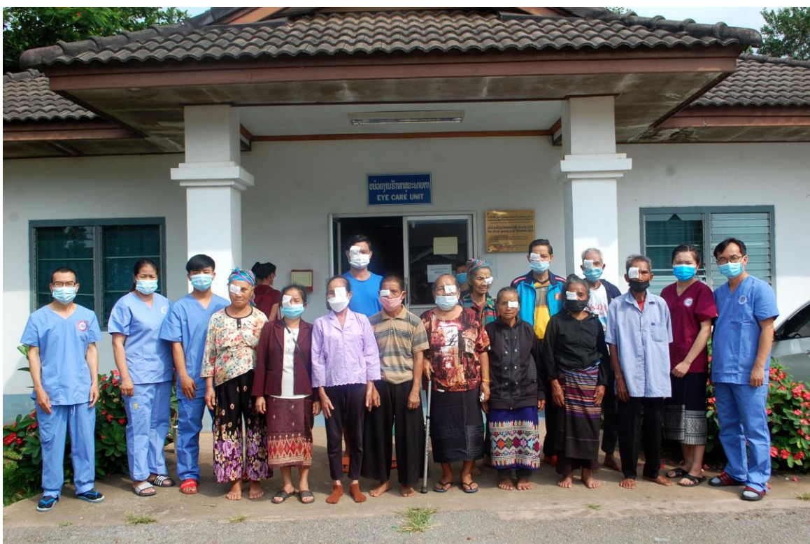
Patients and teamwork post surgery on the 1s day at Oudomxay Provincial Hospital