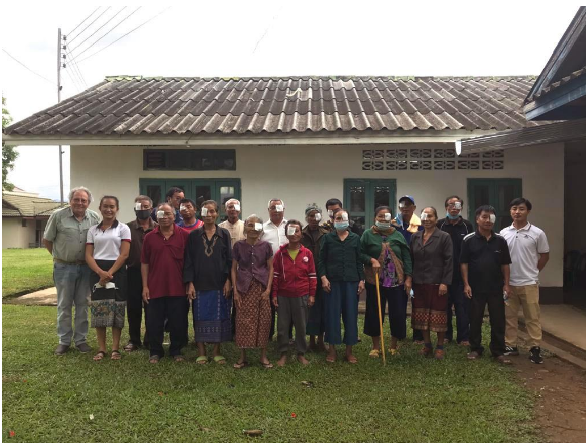
Patients and teamwork post surgery on the 1s day at Houn District Hospital