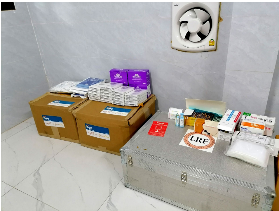
IOL and medicine for cataract surgery in the operating room