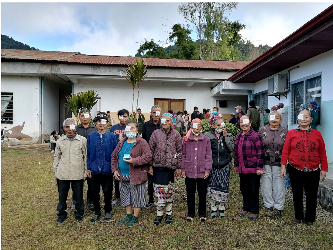
Patients on 1st day post-surgery at Phongsaly District Hospital