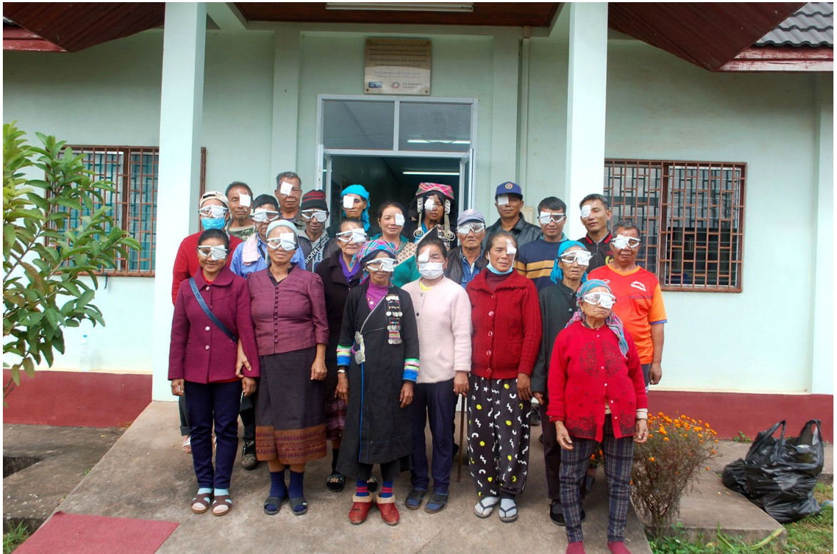
Patients on 1st day post-surgery at Bounneua District Hospital