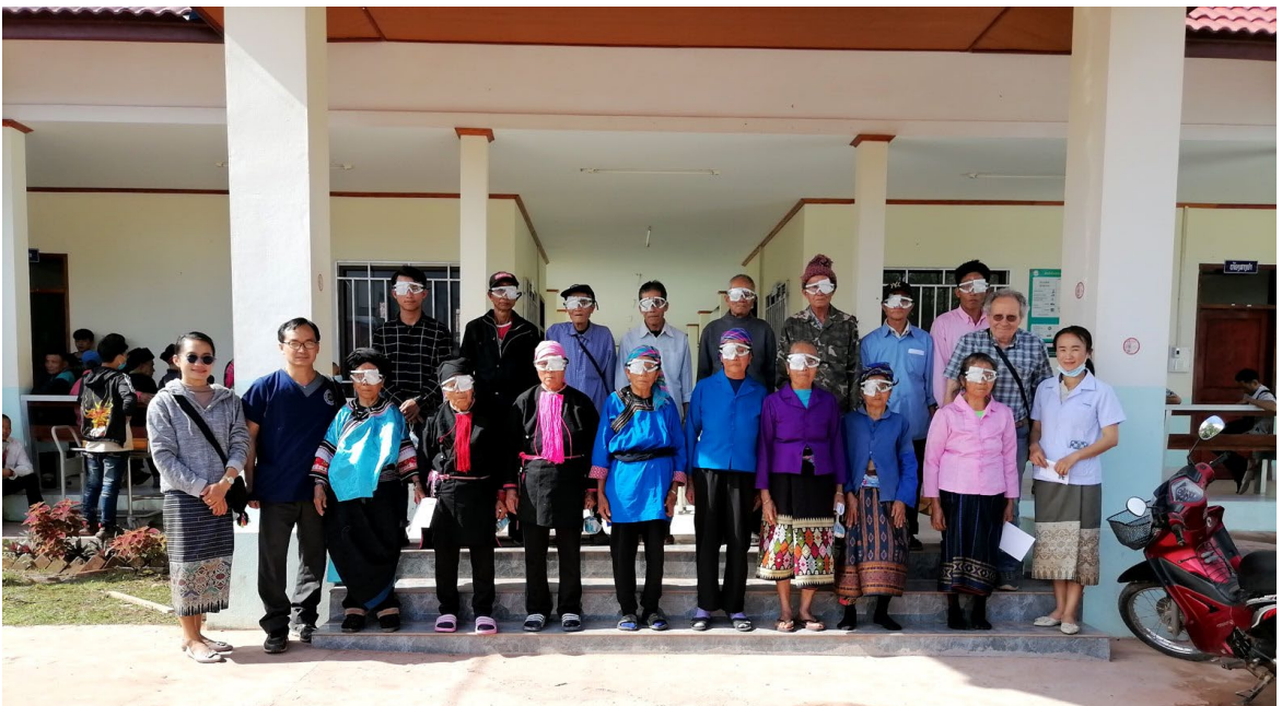
Patients and team on 1st day post-surgery at Yord Ou District Hospital