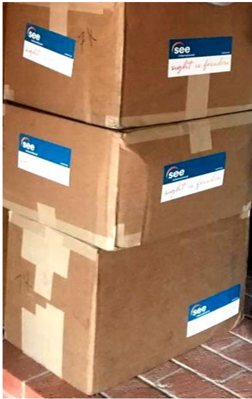
IOLs and medical supplies from Surgical Eye Expeditions International (SEE) on the way to Laos