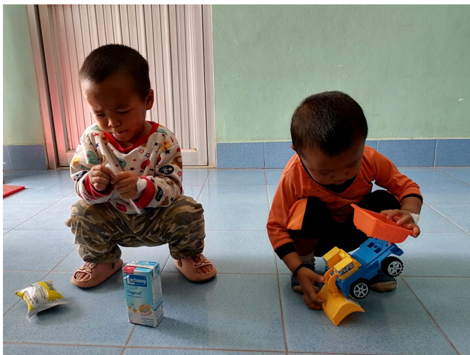
2 boys with congenital cataract on 1 st day post-surgery are happy with good vision, enjoying playing with toys