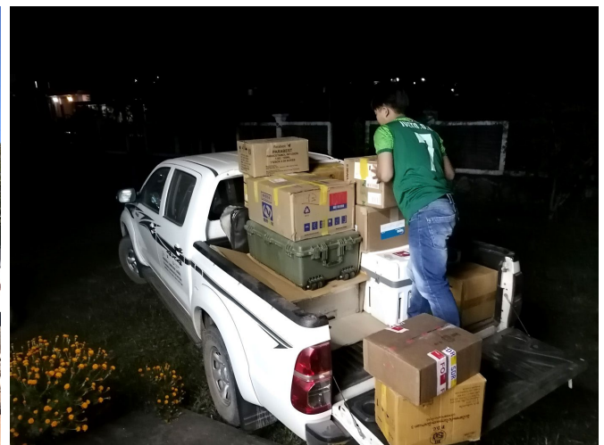
Unloading medical equipment and supplies on arrival at Boun Nuea District Hospital in Phongsaly