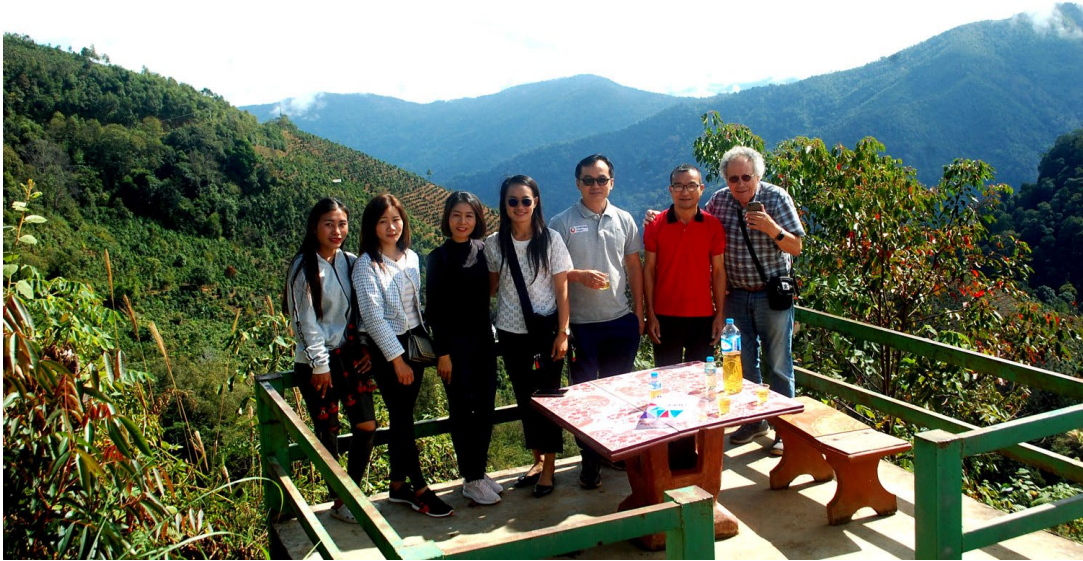
The team (President of LRF, ophthalmologist, ophthalmic nurses and nurse assistants) visiting the famous 400-year-old tea plantation in Phongсалы province