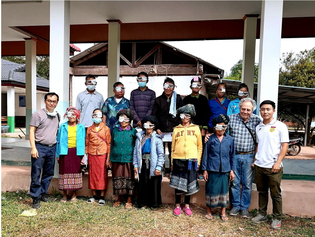
Patients and team on 1st day post-surgery at Yord Ou District Hospital