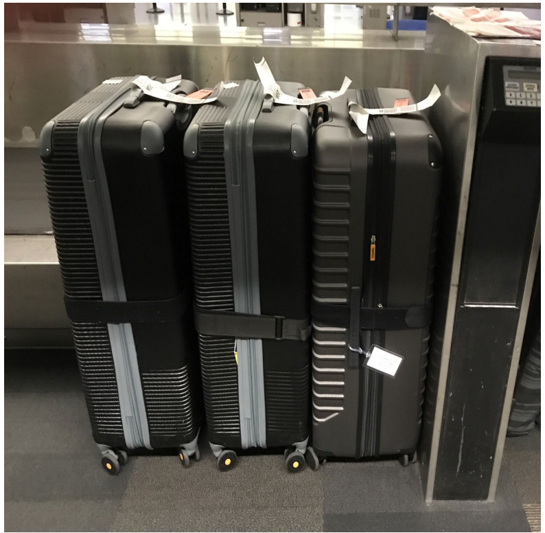
Medical equipment and supplies on the plane from San Francisco to Laos, care of Singapore Airlines