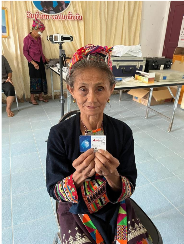
An old ethnic minority patient shows her IOL Card post surgery on 1 st day