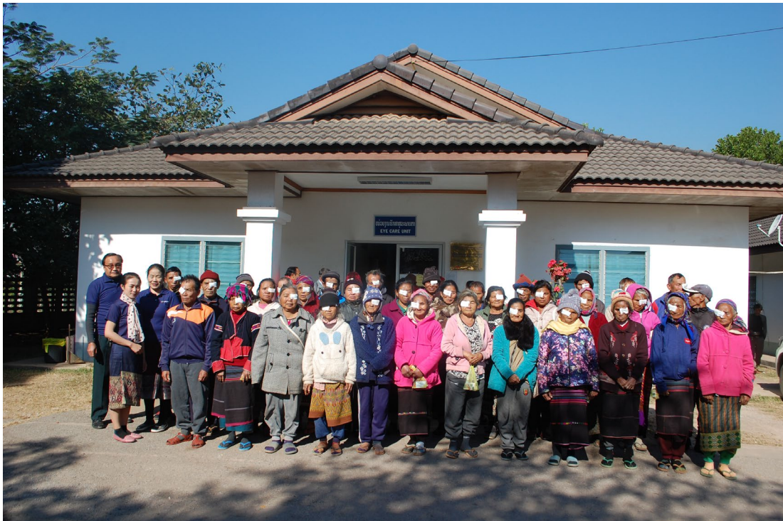
Patients post surgery on the 1s day at Oudomxay Provincial Hospital