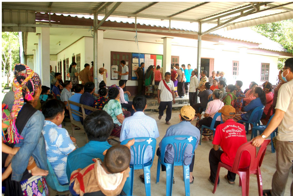
Eye patients registering and waiting to be examined, many ethnic groups at Mai district hospital