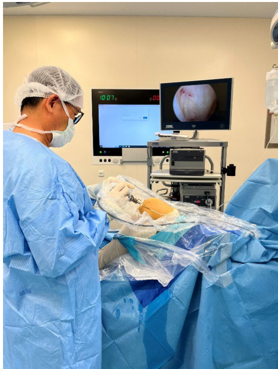
With the support of LRF, a patient receives an MRI and undergoes ACL surgery at Mittaphab Hospital in Vientiane Capital.