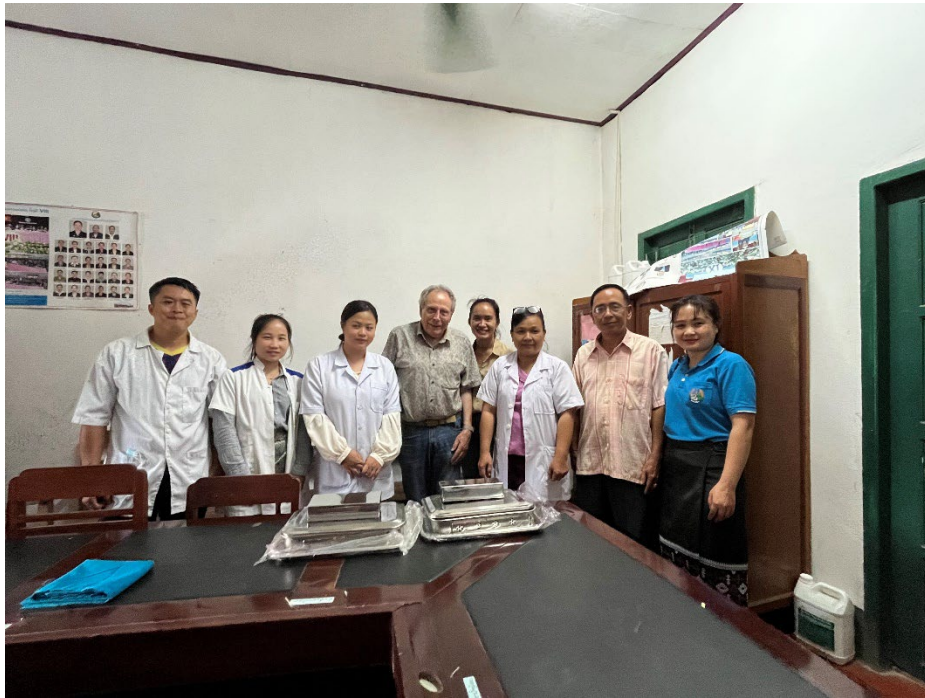
LRF staff are donating medical equipment to Pakbeng District Hospital