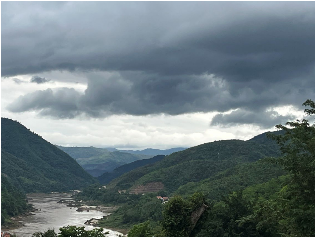
Challenging weather is affecting speed boat travel on the Mekong River in Pakbeng District