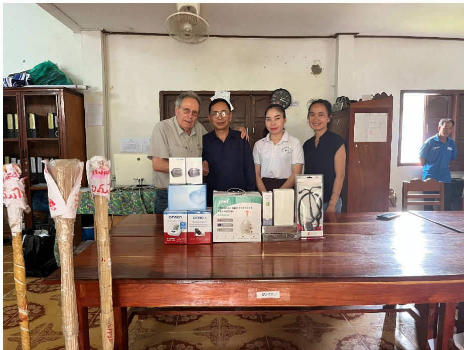
LRF staff are donating medical equipment to Khokkha Health Center