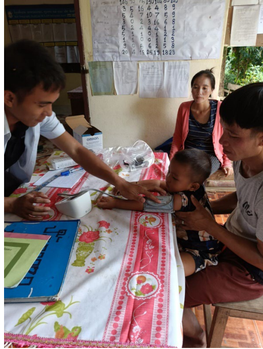
Kokkah Health Center staff is using the donated medical equipment